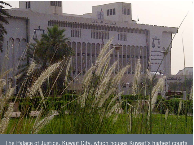
The Palace of Justice, Kuwait City, which houses Kuwait's highest courts

This chapter features some of the most serious of these cases that Amnesty International has documented.