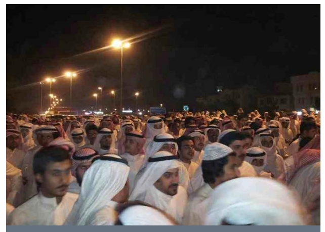
A demonstration outside Kuwait Central Prison, calling for the release of opposition politician Musallam Al-Barrak, Kuwait, 31 October 2012.

The government has used existing laws and adopted new ones to target its critics, including human rights defenders and political opponents, and ultimately close down space for dissent. Judicial authorities have ordered the suspension or closure of newspapers and other media platforms. The government has invoked the country's nationality law to strip some of its critics of their citizenship, sending a stark warning to others of the consequences of speaking out. Members of Kuwait's Bidun community, who are denied Kuwaiti nationality, have been among those arrested and imprisoned for peacefully exercising their right to freedom of expression.