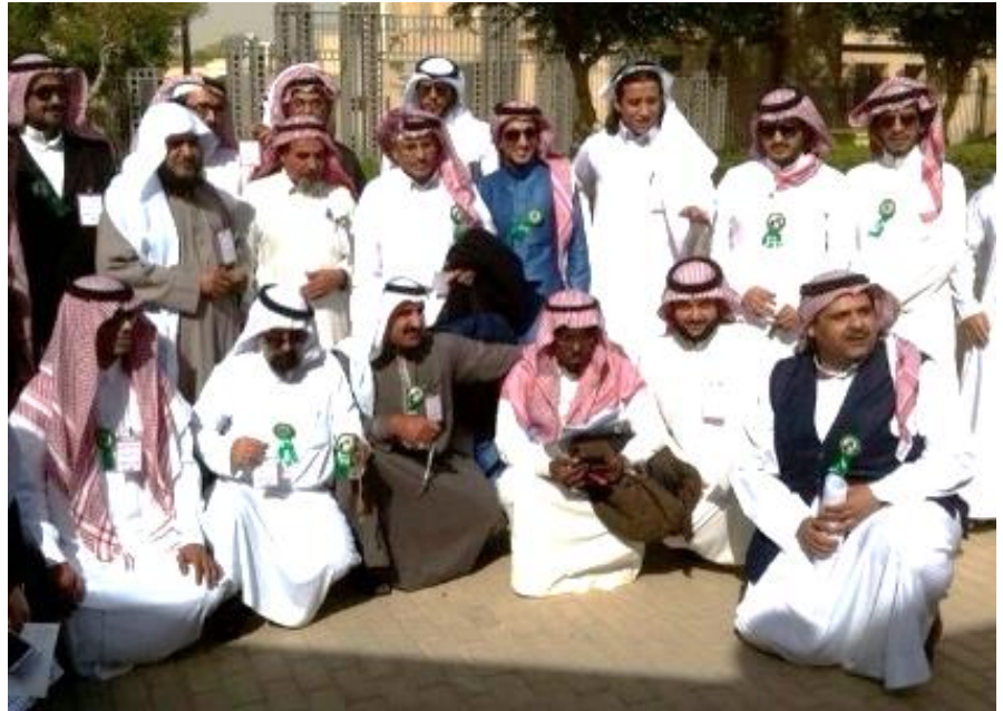
Gathering of ACPRA members and supporters.

future cases; those alleged to have committed similar acts in the past that are now criminalized as terrorism under the decrees are also liable to prosecution, breaching the international legal principle prohibiting retroactive punishment. In June 2014, the Ministry of Justice issued a "confidential and urgent judicial decree" that