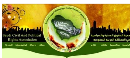
ACPRA logo from the organization's official website.

ACPRA was formed in 2009 by a group of about 15 activists who decided that the organization should operate through a system of collective leadership and regularly rotate its presidency, partly to reduce the risk that any single leader would be targeted by the authorities. It established a presence in several parts of the country, including the central al-Qassim region most affected by the government's internal "war on terror." ACPRA's income came from its members' financial contributions and it operated from the residence of one of its members until the authorities forcibly shut the organization down in March 2013. ACPRA's founding document committed it to the promotion of a distinctly Islamic concept of human rights, based on values such as justice, freedom, cultural and political diversity, and forgiveness, which were seen by its members as predating the modern system of international human rights law.