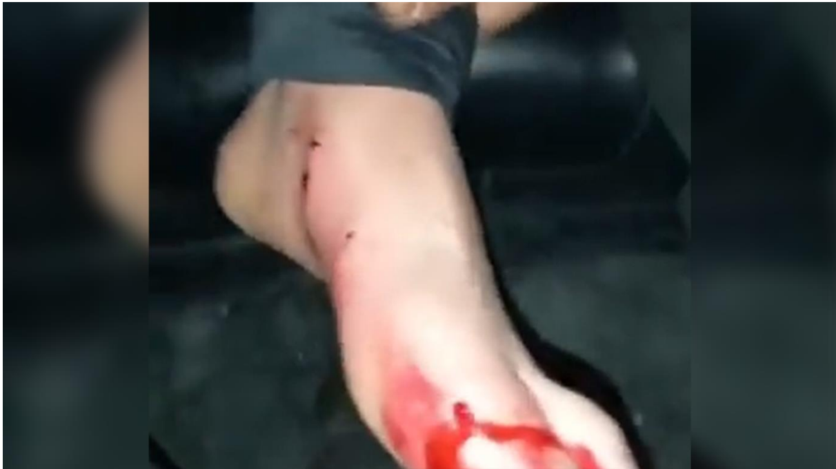
Screenshot taken from a video circulated online on 16 May 2022, showing the injuries sustained by a child during the crackdown of protests in Chaharmahal and Bakhtiari province.

“This is the work of the police [officials from the Law Enforcement Command of the Islamic Republic of Iran (known by its Persian acronym Faraja )] and the Basij [a paramilitary volunteer militia operating under the Islamic Revolutionary Guards Corps] in Chaharmahal and Bakhtiari. They did not even show mercy to a seven [or] eight-year-old-child.”