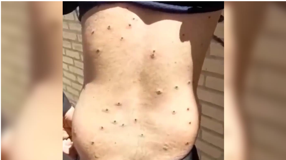
Screenshot taken from a video circulated online on 15 May 2022, showing the birdshot injuries sustained by a protester in Chelicheh. The video also shows injuries to his lower back and buttocks.