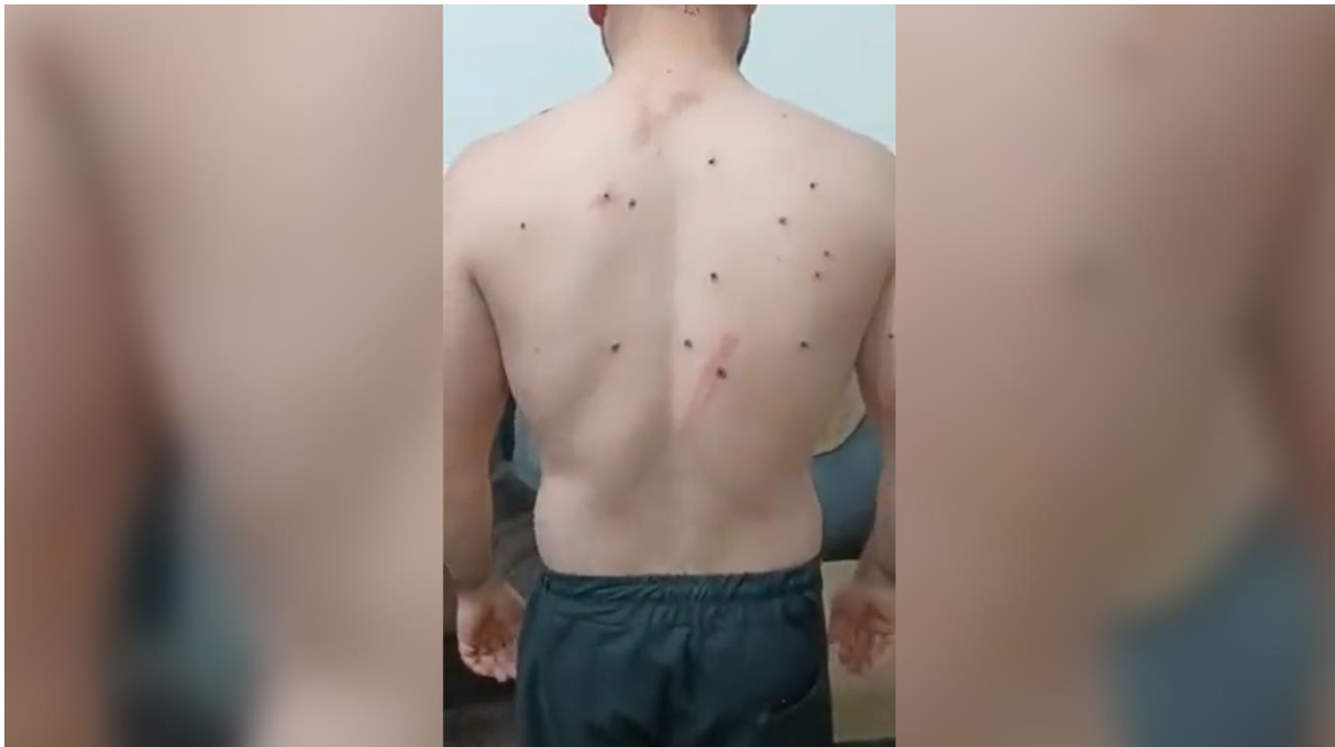
Screenshot taken from a video circulated online on 15 May 2022, showing the birdshot injuries sustained by a protester in Shahrekord. The video also shows injuries to his head.

Two videos, which circulated online on 15 May 2022 and which the persons filming say were from Shahrekord and Chelicheh, show classic spray patterns of birdshot wounds to the backs, buttocks and/or heads of those injured. 33