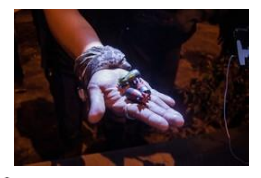
⊕ ↑ Rubber bullets that were fired by the police to disperse protesters in Bangkok, 2021

• Cylinders sometimes with a flight-stabilising component at one end or with foam at the end