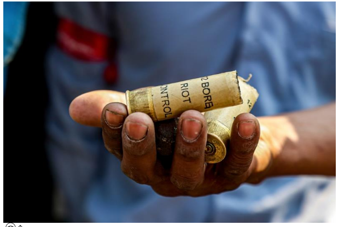
^{\odot} ^{\uparrow} A protester holding bullet shells used by the police and military in Myamar.