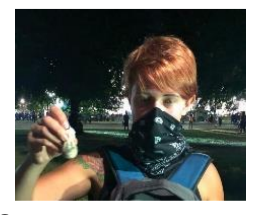
\textcircled{O}^{\uparrow} A protester is holding up the beanbag that hit her backpack in Wisconsin, USA, 2020.