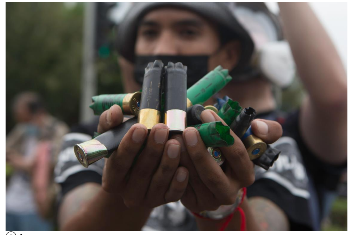
\textcircled{O}^{\uparrow} Protesters showed off rubber bullet casings that riot police fired at protesters. On August 11, 2021 in Bangkok, Thailand.

→ Law enforcement agencies must clearly instruct and train their personnel on the use of kinetic impact projectiles, including specific, narrowly-defined circumstances when and how they should be used, precautions to be taken to minimise harm and clear prohibitions when and how they may not be used. They should only hand out these weapons to certified law enforcement officials.