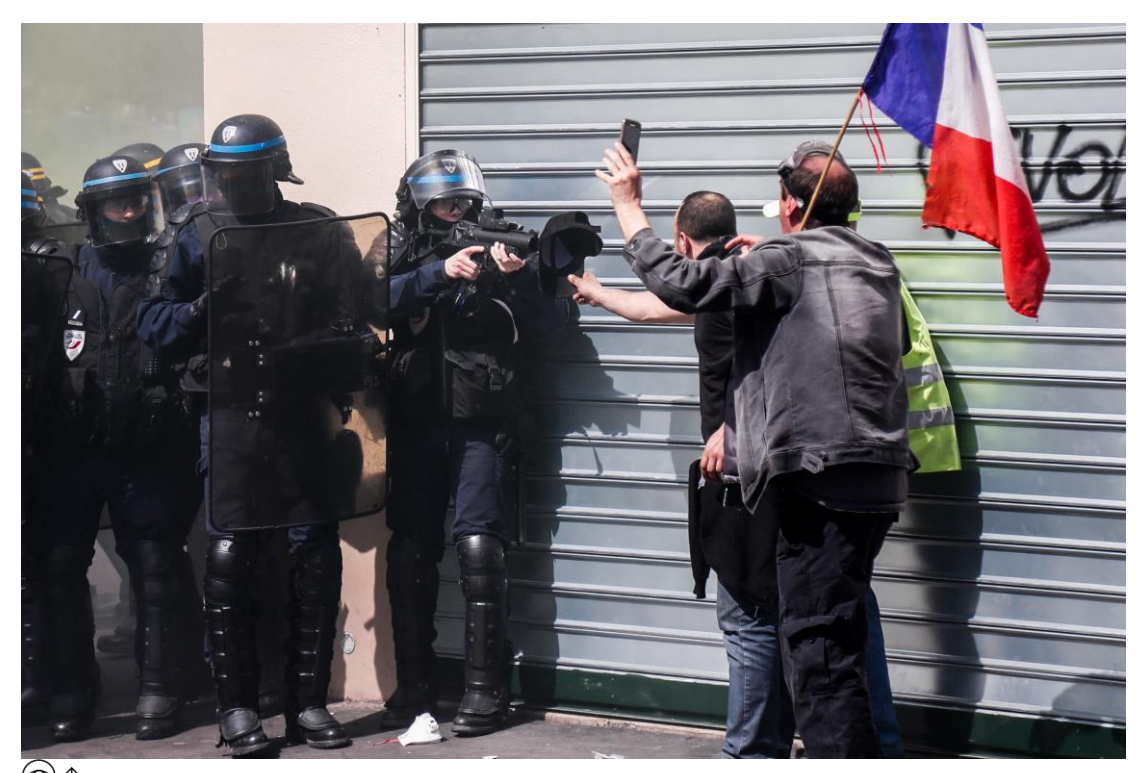
^{\odot} ^{\uparrow} A police officer points a 40-millimetre rubber defensive bullet launcher LBD (LBD 40) towards protesters during an anti-government demonstration in Paris.