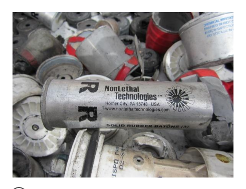
This 'solid rubber baton' round cartridge was found in the aftermath of a lethal raid by riot police early on 17 February 2011 in Manama, Bahrain.