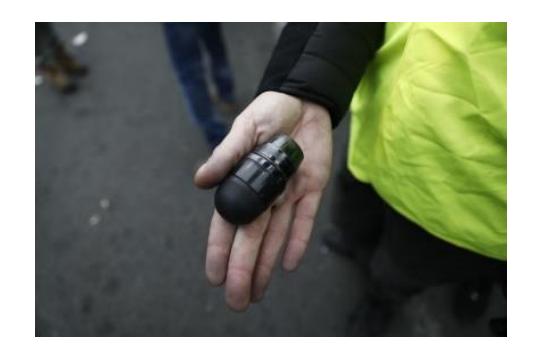
⊕ ↑ Rubber bullet with a foam tip fired by a riot gun during an anti-government demonstration, Paris, January 2019

• Fabric bags that can be filled with different materials, such as smaller bullets, pellets or sand; they are often referred to as bean bags.