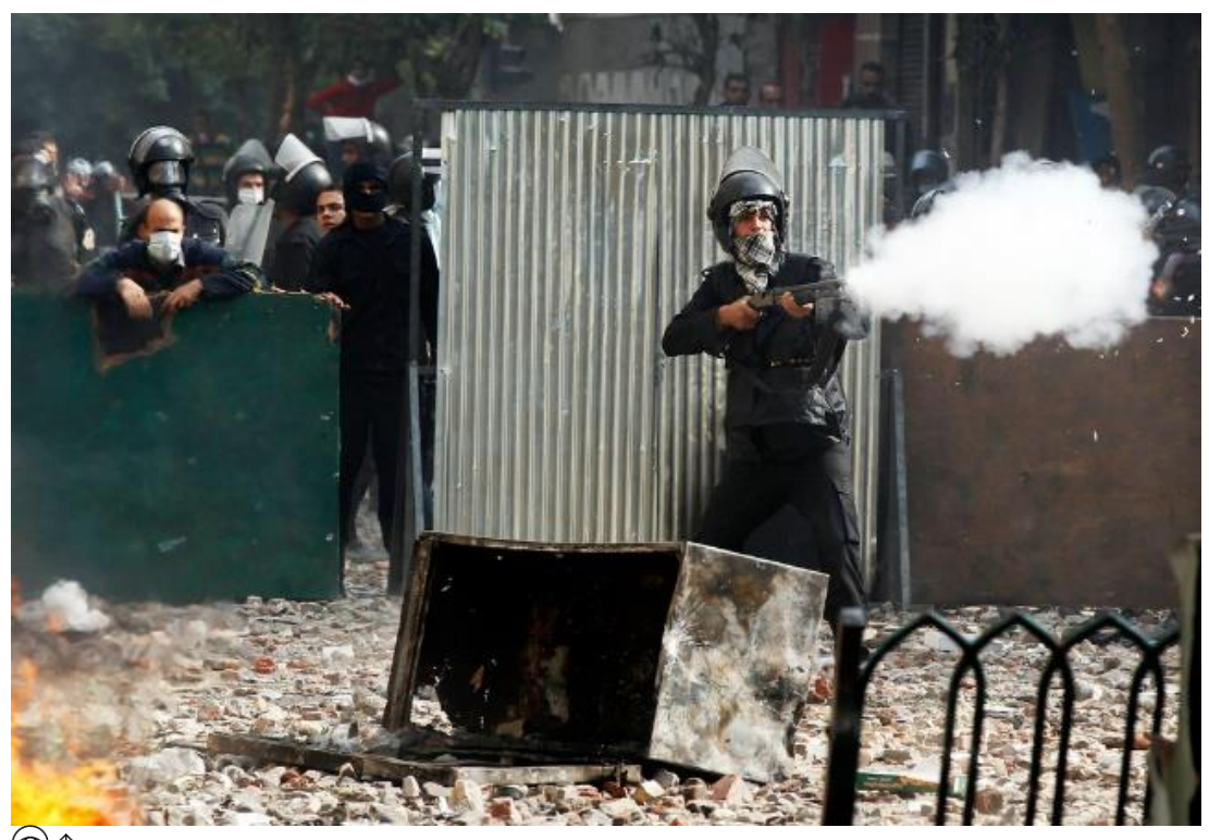
^{\odot} ^{\uparrow} A riot policeman fires a shotgun at protesters during clashes at a side street near Tahrir Square in Cairo, Egypt.