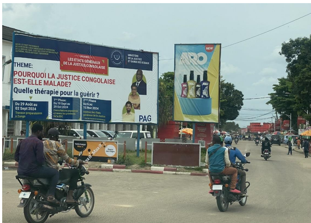
Poster from the campaign of the Ministry of Justice, ahead of the 2024 meetings to discuss reforms of the justice system (Etats généraux de la justice). The poster reads: "Why is Congolese justice sick?" Kisangani, October 2024

war crimes committed in DRC. These conversations have been ongoing for at least 15 years. 90 There appear to be a multitude of projects, led by different actors, that have been subsequently abandoned or suspended, while other projects emerge, in a sort of eternal beginning from scratch. 91 Amnesty International is concerned that this may represent a façade commitment to justice without genuine intent for these processes to lead to the successful establishment of an independent, impartial and efficient judicial mechanism.