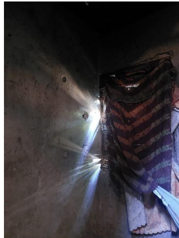
On the left, a woman showing a hole in the rooftop of her family's house, where a bomb fell. On the right, bullet marks in the wall in the same house. Kisangani, October 2024

A woman recounted her experiences to Amnesty International: “We had a bar in our house. It was in this bar that they [soldiers] stored the corpses of the Rwandan soldiers. My father asked for the bodies to be brought out, and in response they shot him. The child was on his knees, he fled and hid in the house, while the soldiers continued to shoot at the others. In my house they killed six people at close range: my father, my mother, my sisters and my children. In the house there are the after-effects of these fights, the traces of blood and the traces of bullets. The house has never been rehabilitated, we [the child who survived and herself] can't bear to go back.” 21