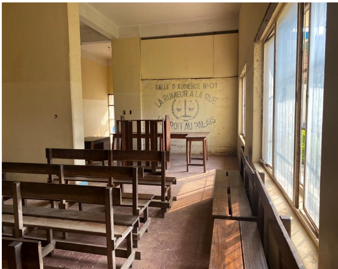
An empty courtroom in Kisangani, October 2024.

In 25 years, there have not been any criminal judicial investigations or prosecutions for crimes against civilians in Kisangani during the one-day, three-day or six-day wars. No individual has been brought to court to answer for these crimes.