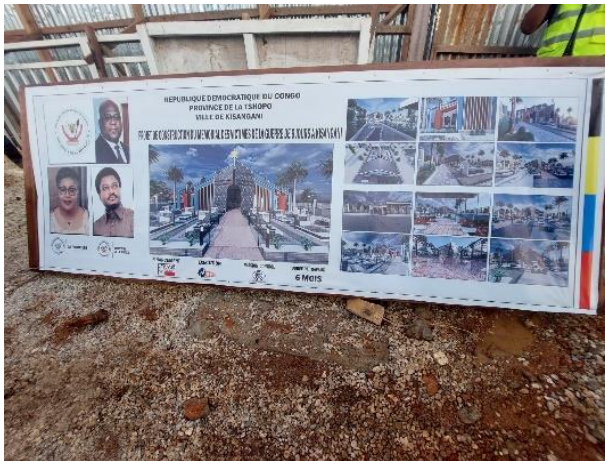
Plans for the construction of a memorial by FRIVAO

“There is good, bad and worse with what is happening at the FRIVAO. FRIVAO is a good initiative but the way things work is not right.” 105 said a human rights defender.