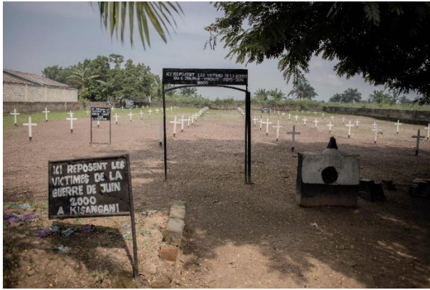
A view of the old cemetery for victims of the six-day war in Kisangani