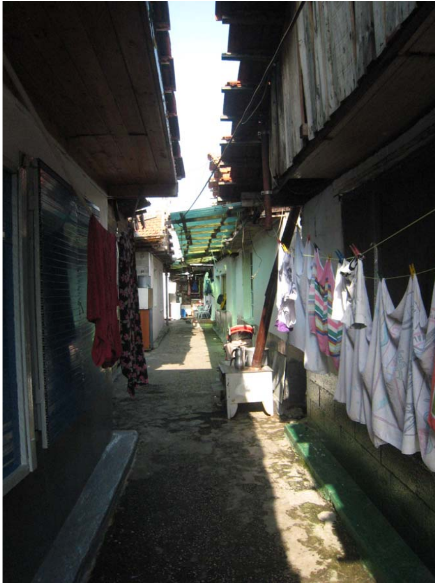
The authorized camp of Via Novara, July 2011.