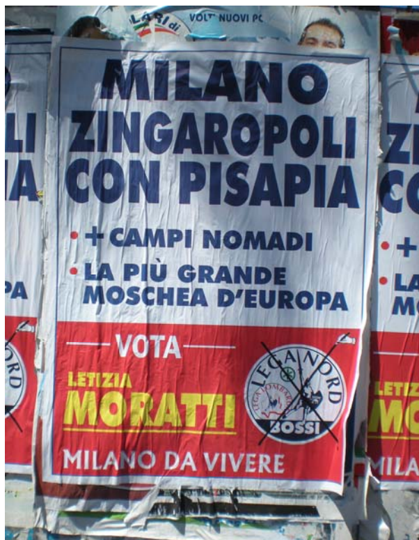
Election poster of the political party "Northern League".