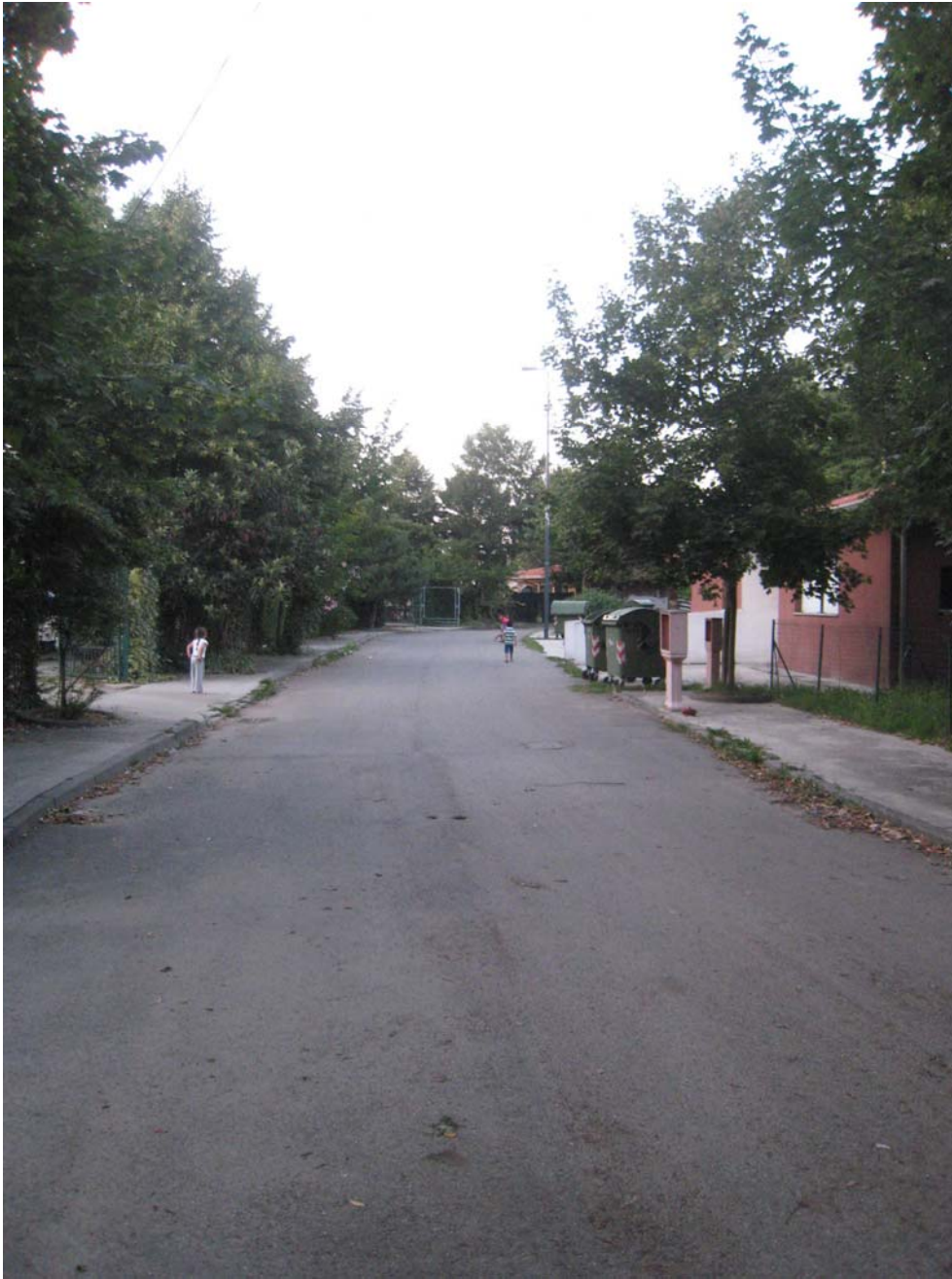
A view of the camp in Via Idro.