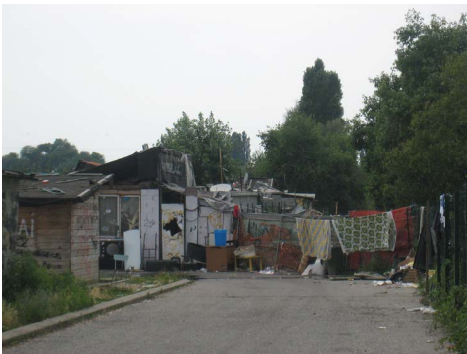
The authorized camp of Via Novara, inhabited by Roma from the Former Yugoslavia, July 2011.