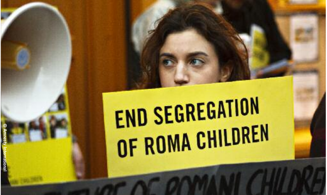
Demonstration in front of the Slovak embassy in London, UK, to end segregation of Romani children, 2010.