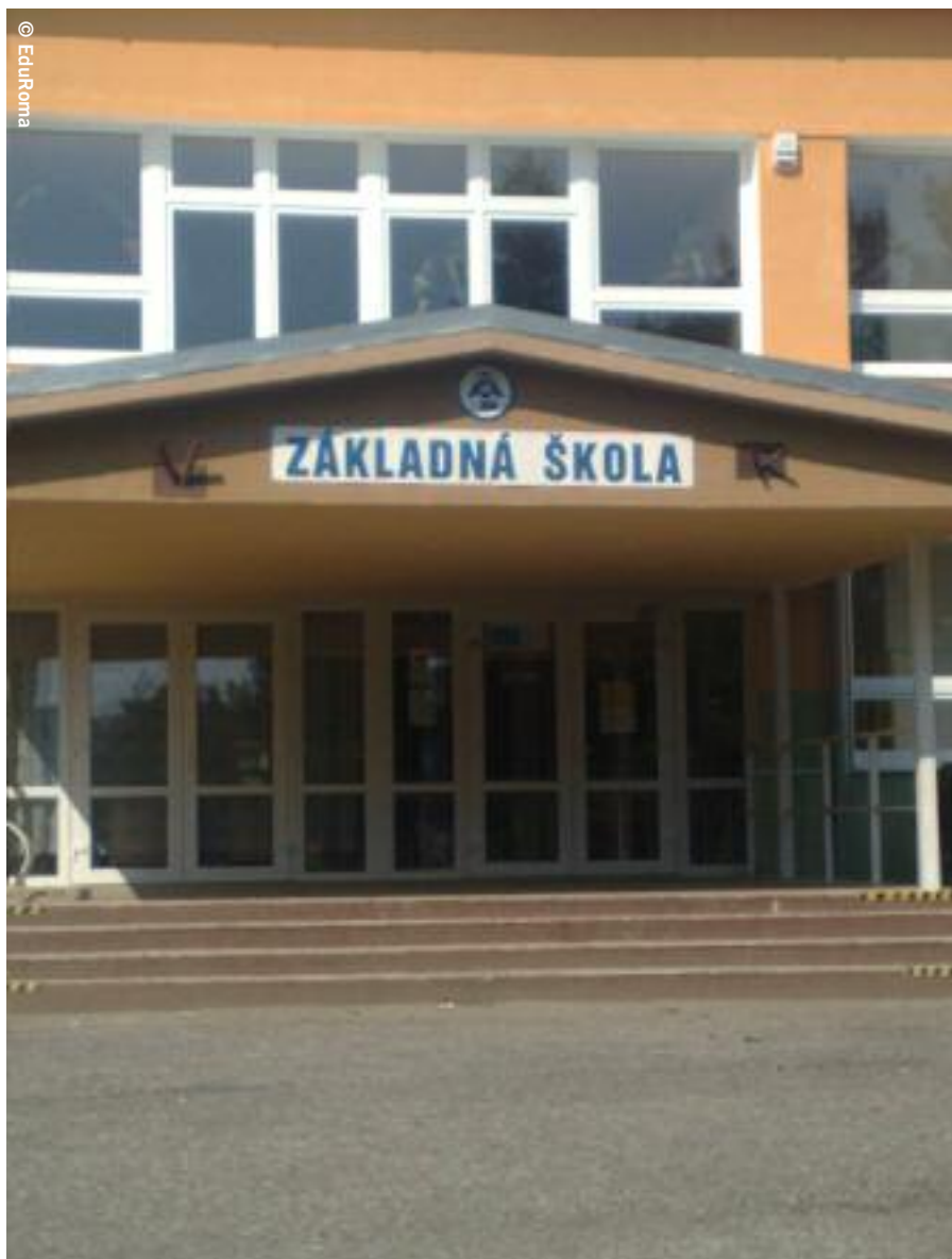
Outside the elementary school in Šarišské Michal'any, eastern Slovakia, 2013.

Using the provisions of the Anti-discrimination Act, the Centre for Civil and Human Rights, a Slovak NGO, initiated a complaint against the school to the District Court in June 2010. The Centre argued that placing Romani children in separate classes was discriminatory and violated their right to equal access to education.