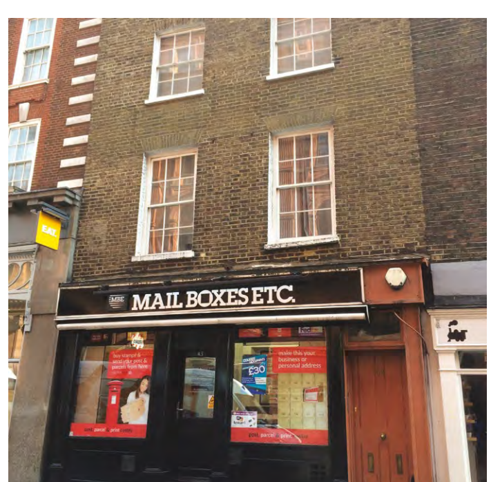
43 Bedford Street, London

Amnesty International is unable to determine how much – if any – of this weaponry has yet been delivered to South Sudan. UK law prohibits UK individuals or companies from any involvement in