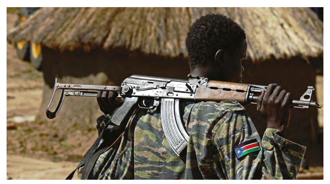
A Sudan People's Liberation Army (SPLA) soldier holds an AKMS type rifle outside Juba on April 14, 2016.

Elements of the Sudanese government provisioned SPLA-IO forces with newly-manufactured ammunition through airdrops and overland supplies in 2014 and 2015. A Chinese shipment of US$38 million-worth of small arms and ammunition, contracted by the South Sudanese government before the outbreak of fighting in December 2013, arrived via Kenya for the government in mid-2014; along with Israeli-made assault rifles supplied by Uganda, new armoured personnel carriers from a subsidiary of a Canadian-owned company, the Streit Group, based in the UAE, and attack helicopters from Ukraine supplied via a Ugandan intermediary at a cost of up to US$73 million. Wraine's most recently issued arms export report which covers 2016 includes transfers of 170 light machine guns and 88 heavy machine guns to South Sudan; the 2015 report included transfers of 5 Mi-24V attack helicopters, with 830 light machine guns and 62 heavy machine guns reported for 2014.