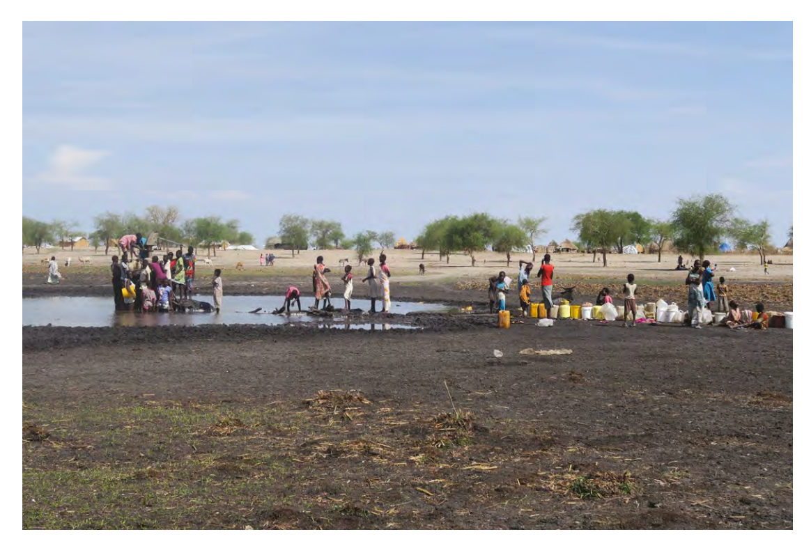
Long queues to get a tiny quantity of filthy and contaminated water in a settlement for internally displaced persons (IDPs), in Aburoc, South Sudan, © Amnesty International