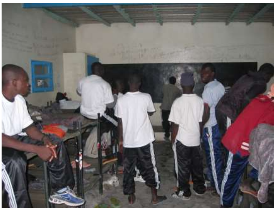
Migrants in the Nouadhibou Detention Centre

Corroborating information indicates that some members of the security forces do carry out arbitrary arrests of foreign nationals, notably nationals of ECOWAS countries. These people, arrested in the street or at home, apparently without any evidence, were allegedly accused of intending to leave Mauritania irregularly to travel to Europe. Some of these people, held at the detention centre at Nouadhibou to await being sent back to Mali or Senegal, told the Amnesty International delegation that they were legally present in Mauritania and that, at the time of their arrest, the security forces had torn up their residence permits. Amnesty International fears that these arbitrary arrests are one of the perverse effects of the pressure exerted by the EU on the Mauritanian government.