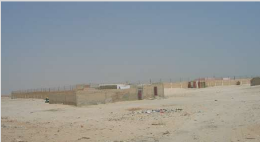
© AI – Nouadhibou Detention Centre

For its part, the Spanish party undertakes to support Mauritania in the construction and management of such centres". 23