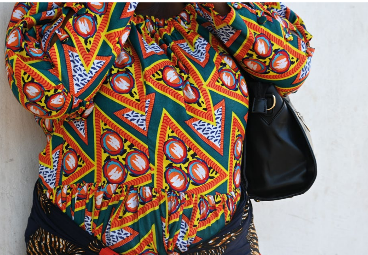
Malawian woman trader in Musina. For women informal cross-border traders, their vulnerability to economic exploitation is heightened due to gender-based discrimination at borders and perceived lack of legal protection. Amnesty International, South Africa, 2023

intermediaries take advantage of the women traders' reliance on them by charging excessive fees and dictating prices for their services. With control over logistics, they wield significant influence in cross-border transactions, determining the timing and method of goods transportation. Additionally, women reported instances of theft and fraud by these intermediaries, further impacting their financial stability and making trading activities increasingly challenging. 209 One woman said “yes sometimes we can get robbed by transport people, when you are transporting something expensive, they take it and say it was confiscated” another said “they work in syndicates these people, if they see you have a lot of money that day when you cross the border there is someone on the other side to take it from you.” 210