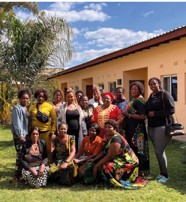
Women cross-border traders and former cross-border traders in Lusaka. While women make up the majority of cross-border traders, the research revealed a dominance of male leadership in informal cross-border trader associations (CBTAs), which raises issues of equitable representation in policy debates. Amnesty International, Zambia, 2023

When Amnesty International inquired about the reason for men dominating the leadership positions in organisations representing a profession primarily occupied by women, the responses from the women in focus group discussions were diverse, yet they predominantly revolved around the gendered dynamics prevalent in African society. One woman expressed, “We believe that only men are taken seriously when addressing leaders; influential people don’t engage with women.” 406 Many others cited the strenuous demands of their work, coupled with their caregiving responsibilities, as factors that leaves them with limited time to assume leadership roles within these organizations.