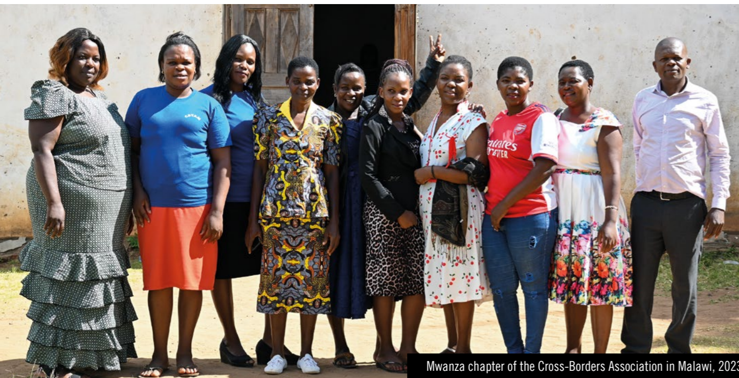
Mwanza chapter of the Cross-Borders Association in Malawi, 2023

It is within the context of gendered working conditions that women engaged in informal cross-border trading navigate a challenging landscape. The confluence of these conditions creates a scenario where their right to decent work is significantly constrained and makes them vulnerable to human rights abuses.