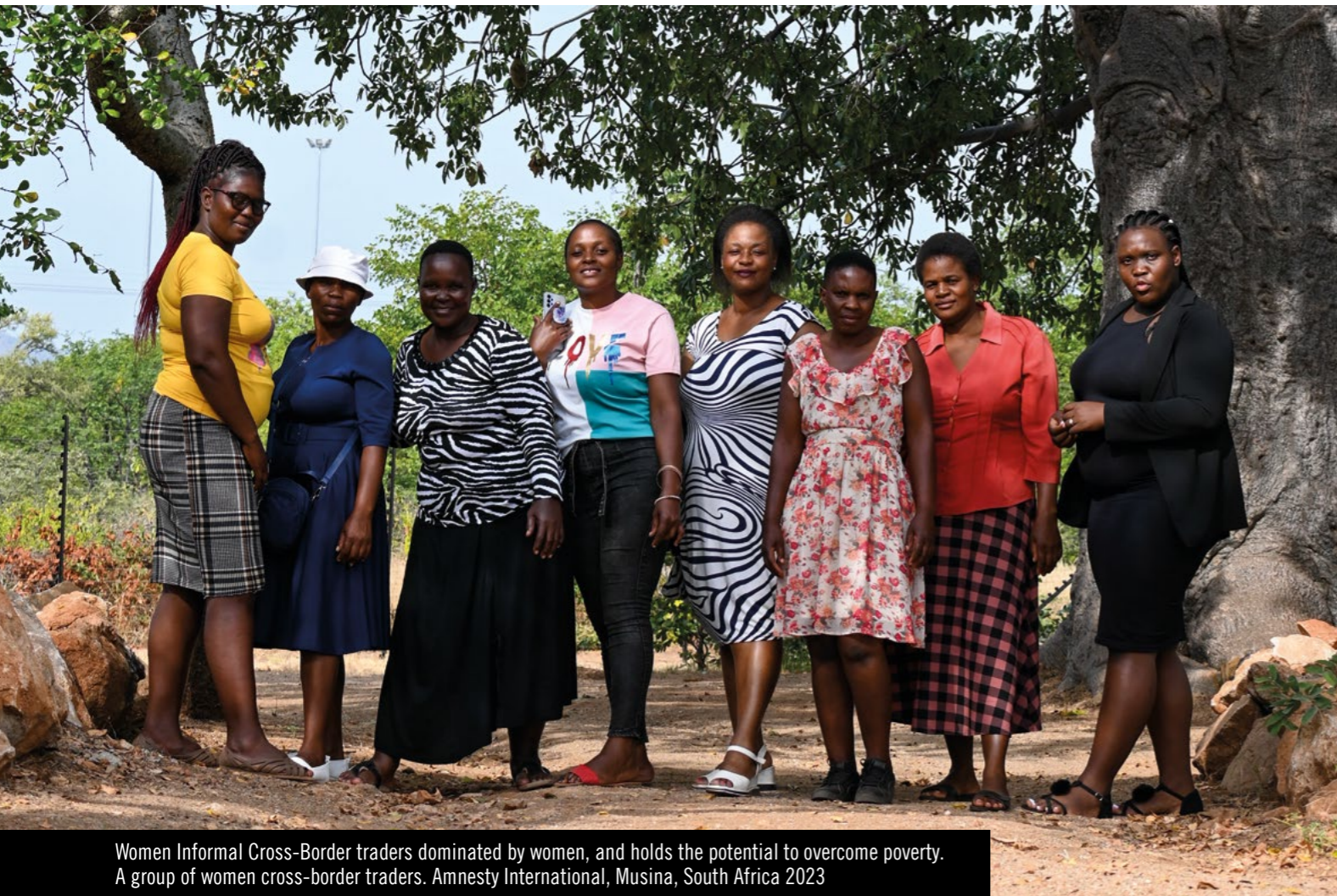
Women Informal Cross-Border traders dominated by women, and holds the potential to overcome poverty. A group of women cross-border traders. Amnesty International, Musina, South Africa 2023

While there are reports of growing prevalence of informality in higher income countries, most workers in the lower income countries are informally employed. In Africa, nearly 9 out of every 10 of those who work do so informally, accounting for nearly 86% of all employment and 42% of the continent's gross domestic product (GDP). 22 The extent of informality is lower in the Southern Africa region, with an average 40% 23 of the population in informal employment as of 2019. 24 Informality is present in a wide range of industries and occupations and includes a diverse range of activities and working