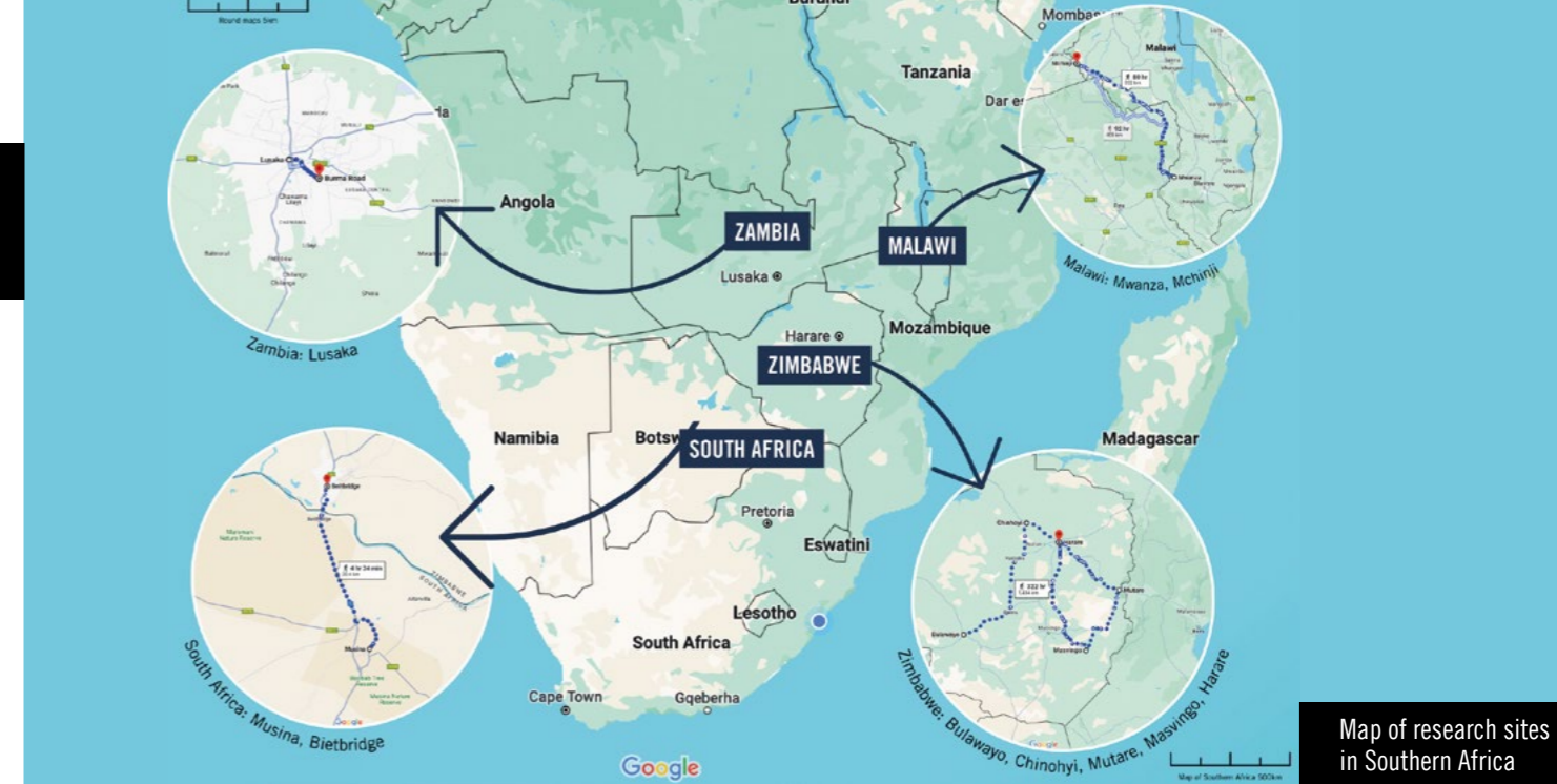
Map of research sites in Southern Africa

In Zimbabwe, researchers conducted five focus group discussions in Harare, Bulawayo, Masvingo, Mutare, and Chinhoyi speaking to a total of 88 women. In South Africa, researchers visited Musina, the northernmost town in the Limpopo province, only 23kms from the Beitbridge border town in Zimbabwe. Here researchers conducted three focus group discussions, nine in-depth interviews as well as observational analysis at the Beitbridge border and flea-markets in Musina, speaking to a total of 30 people (five men and 25 women). In Malawi researchers travelled to the border towns of Mwanza and Mchinji and held three focus group discussions and individual interviews as well as conducted observational analysis at the Mwanza border and the Mchinji one-stop border post, speaking to a total of 26 people (20 women and six men). In Zambia researchers travelled to Lusaka and conducted two focus group discussions and five individual interviews, speaking to a total of 17 people (15 women and two men). All focus group discussions and in-depth interviews were conducted by Amnesty researchers in English with simultaneous interpretation in Shona, Ndebele, Chichewa and Bemba.