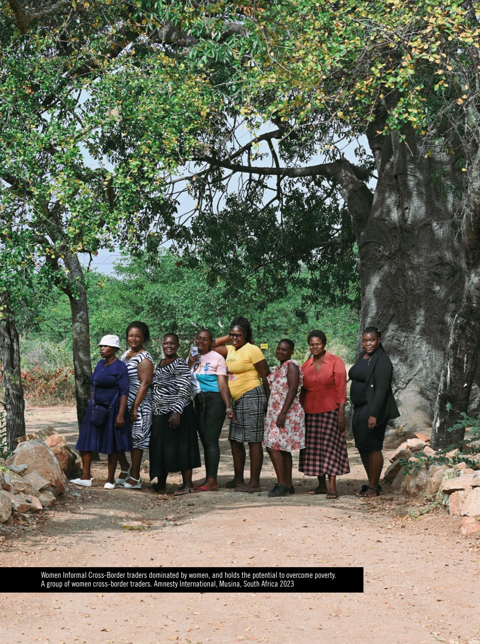
Women Informal Cross-Border traders dominated by women, and holds the potential to overcome poverty. A group of women cross-border traders. Amnesty International, Musina, South Africa 2023