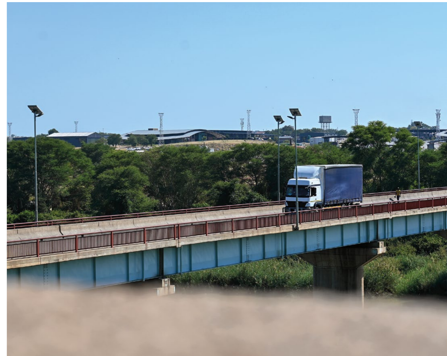
Truck crossing the Beitbridge border post, Musina, South Africa, 2023