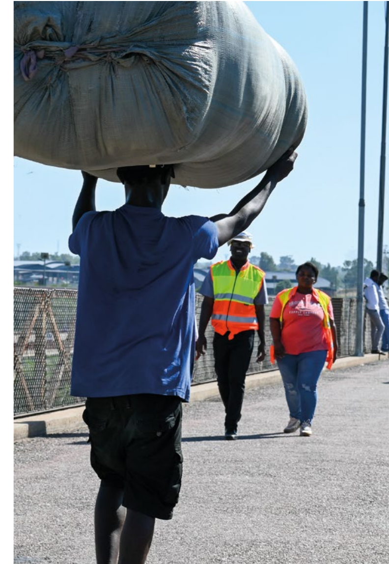
Zalawi man transports goods across the border, offering cheaper rates than Malayisha. However, their irregular crossings pose risks of goods being lost or confiscated. Zalawi also face personal risks like physical strain and exposure to the uncertainties of irregular border crossings. Amnesty International, Musina, South Africa, 2023

including the harm suffered by WICBT. The actions causing losses to WICBTs are oftentimes carried out by agents of the State while performing their duties. As a result, the State has an obligation to prevent such acts and protect women against this violation. The uncertain and unpredictable nature of bribery, heightens the risks and costs associated with this practice. 219