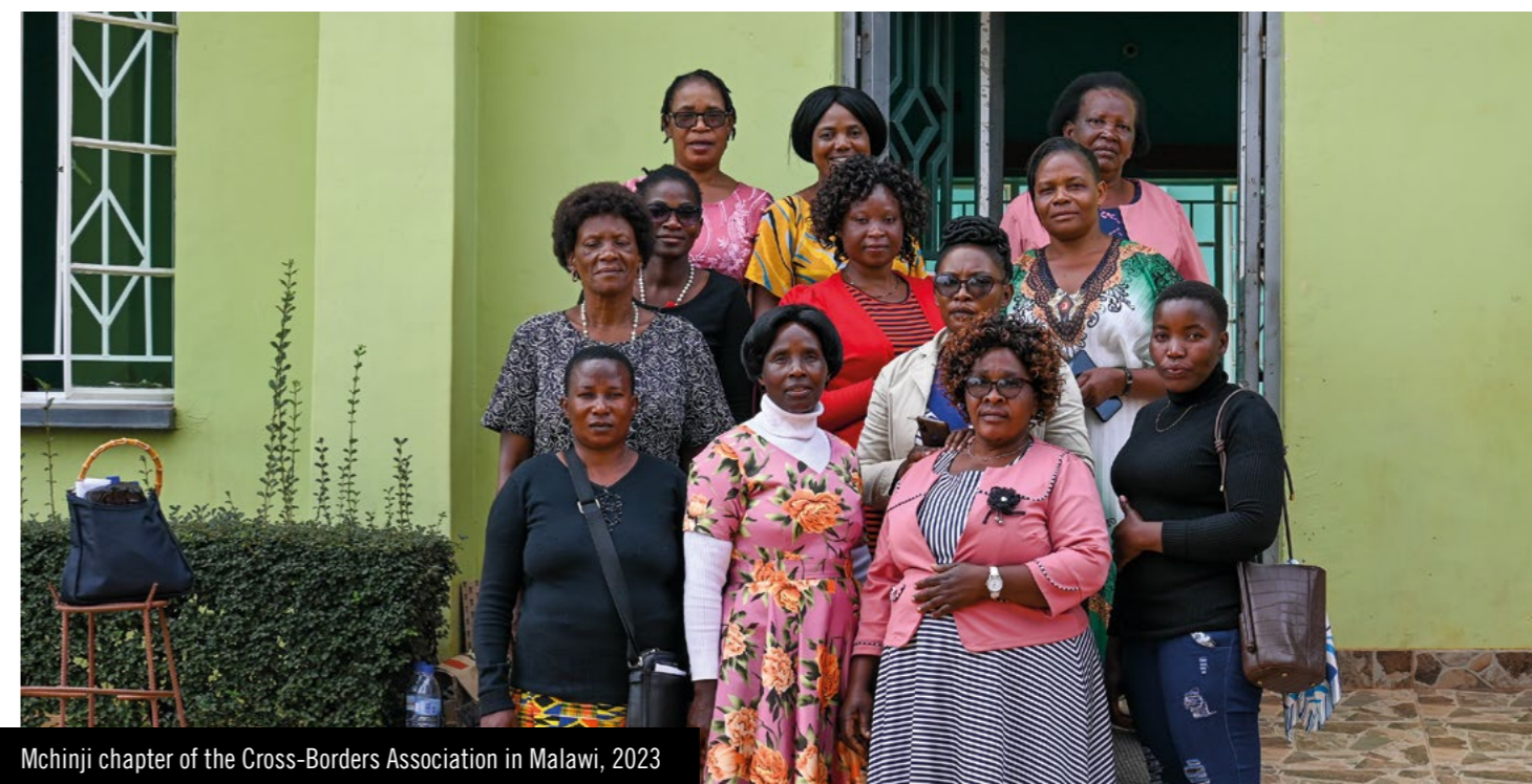
Mchinji chapter of the Cross-Borders Association in Malawi, 2023

In addition to its economic benefits, informal cross-border trade can also have a positive impact on women's social and political life. Women involved in trade often form networks and communities, providing them with a platform to exchange ideas, share information, and support one another. This can help to build women's confidence and build collective power for tackling social and economic issues they face. 152