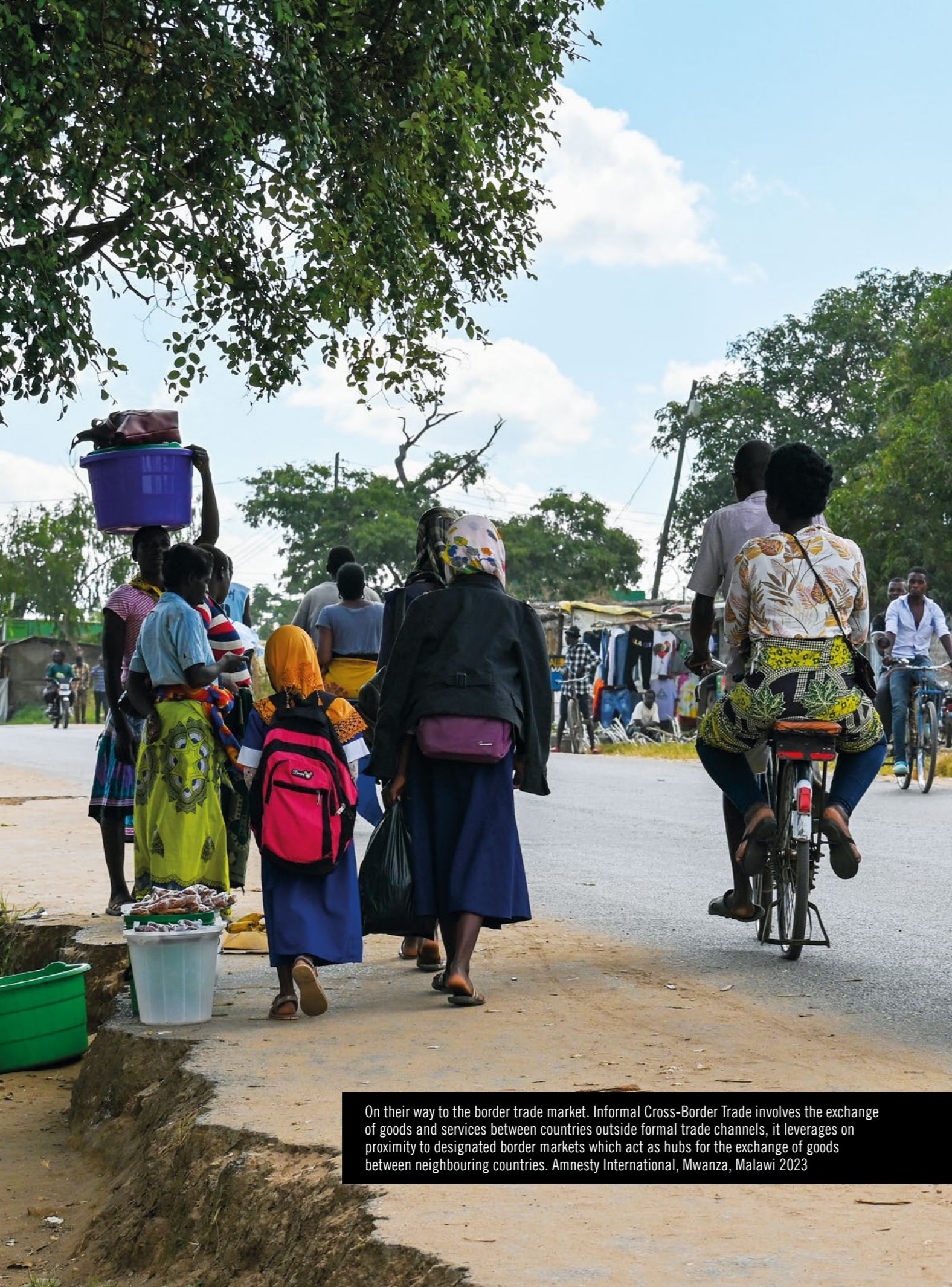
On their way to the border trade market. Informal Cross-Border Trade involves the exchange of goods and services between countries outside formal trade channels, it leverages on proximity to designated border markets which act as hubs for the exchange of goods between neighbouring countries. Amnesty International, Mwanza, Malawi 2023