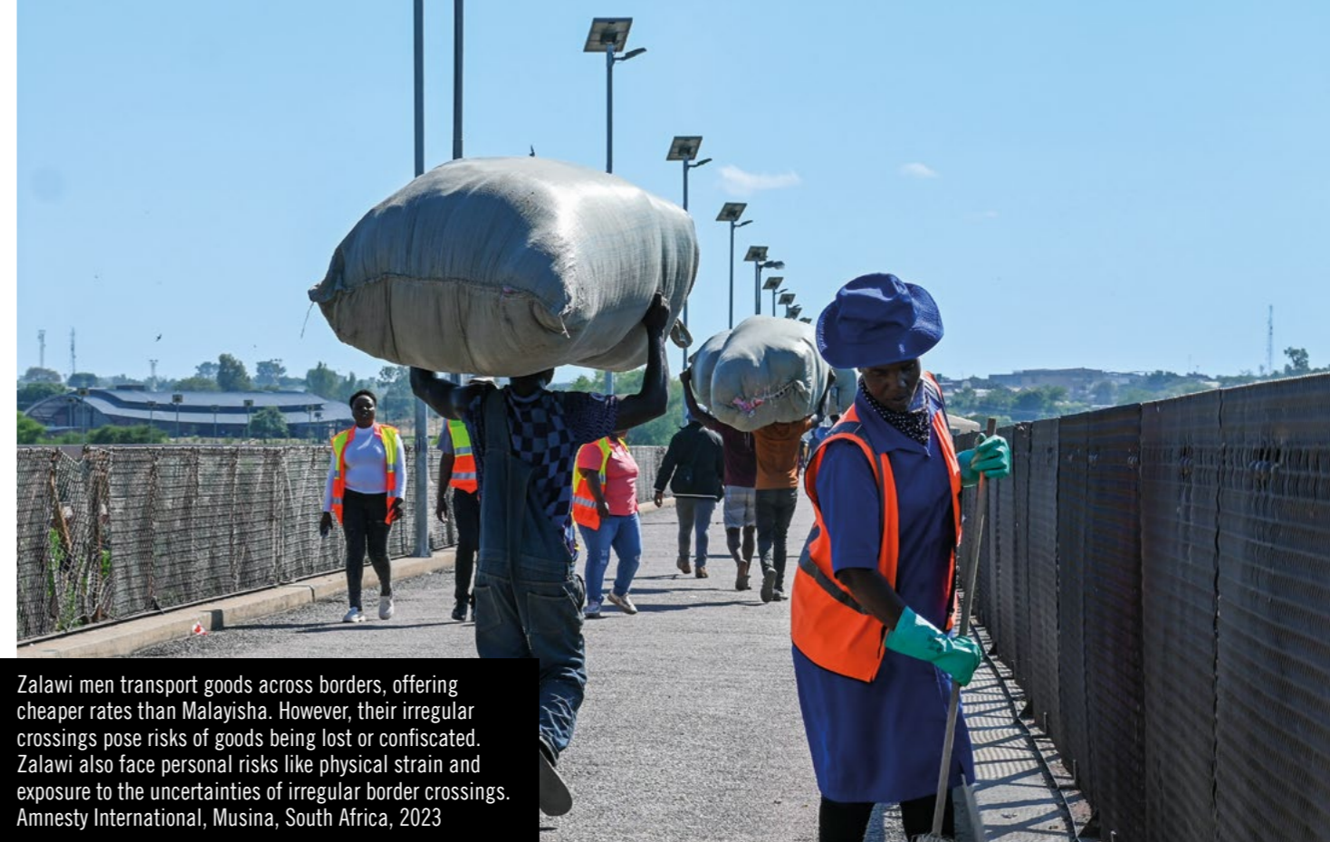
Zalawi men transport goods across borders, offering cheaper rates than Malayisha. However, their irregular crossings pose risks of goods being lost or confiscated. Zalawi also face personal risks like physical strain and exposure to the uncertainties of irregular border crossings. Amnesty International, Musina, South Africa, 2023

Some traders admit having to resort to evasive measures, such as bribery to cope with these forms of taxation, creating opportunities for corrupt practices to thrive.