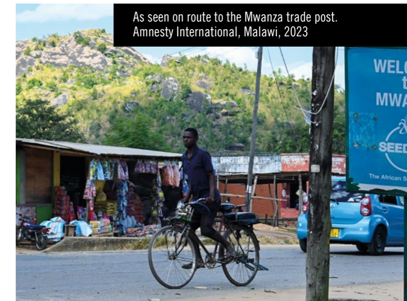
As seen on route to the Mwanza trade post. Amnesty International, Malawi, 2023

the urgent need for sweeping reforms aimed at building inclusive social protection systems that are responsive to the diverse needs of all individuals, particularly vulnerable populations such as women engaged in the informal sector. In addition to this and compounding matters, women in informal cross-border trade also face a heavy care burden, contributing to significant "time poverty" and impacting their physical and mental well-being. Health challenges, including stress, anxiety, and reproductive concerns, are prevalent among women traders, aggravated by limited access to healthcare due to high mobility.