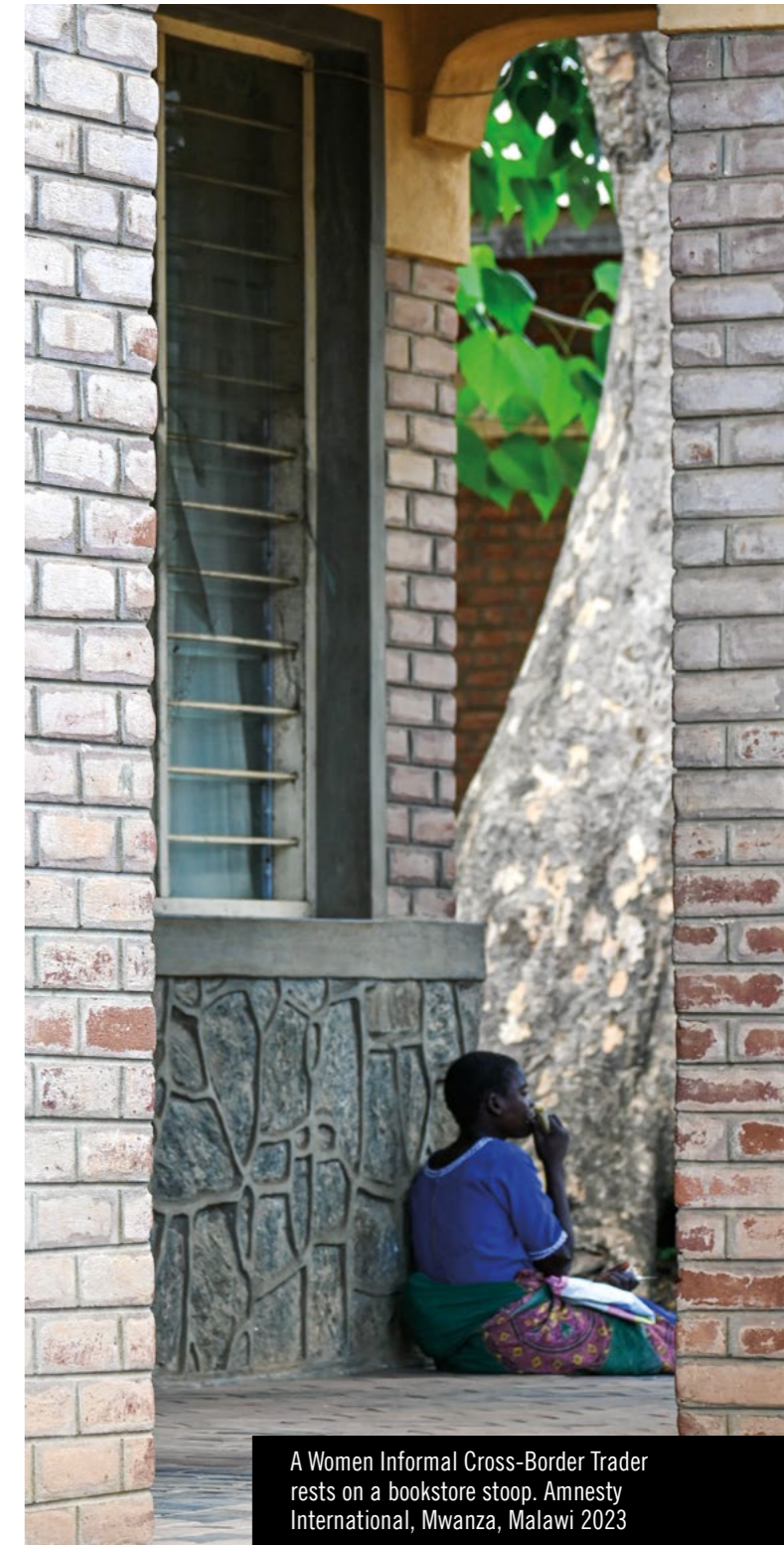
A Women Informal Cross-Border Trader rests on a bookstore stoop. Amnesty International, Mwanza, Malawi 2023

The human rights framework governing informal cross-border trade in Southern Africa encompasses key international instruments focused on the rights of women and the right to work. The Universal Declaration of Human Rights (UDHR), Convention on the Elimination of All Forms of Discrimination Against Women (CEDAW), and the Maputo Protocol, among others, highlight commitments made by Malawi, Zambia, and Zimbabwe in addressing gender-based discrimination and promoting economic, social, and cultural rights. The right to work, outlined in various instruments such as the International Covenant on Economic, Social and Cultural Rights (ICESCR) and the Banjul Charter, reflects commitments to fostering lawful economic activities. The ILO Decent Work Framework, although not legally binding, aligns with broader international commitments and principles, emphasizing fair, inclusive, and dignified labour practices for all workers, including those in the informal sector. Despite variations in country contexts, the analysis of informal cross-border trade reveals a consistent pattern of human rights violations faced by women across the region, emphasizing the need for a comprehensive human rights approach to address key violations.