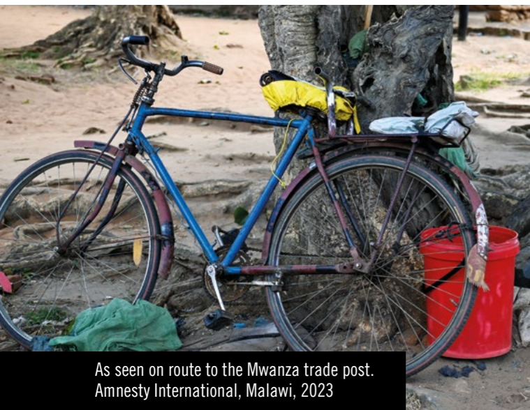
As seen on route to the Mwanza trade post. Amnesty International, Malawi, 2023

Amnesty International's research reveals that women engaged in informal cross-border trade experience alarming rates of gender-based violence, spanning economic, sexual, and physical abuse. This infringes upon their right to security and hampers their enjoyment of other fundamental human rights, including the right to decent work. Despite international mandates for gender equality and protection against discrimination in the workplace, women in informal cross-border trade remain vulnerable to various forms of discrimination and violence, often perpetrated by both State and non-State actors. State agents, such as border officials, are reported to be among the perpetrators, subjecting women to harassment, intrusive searches, and even sexual exploitation.