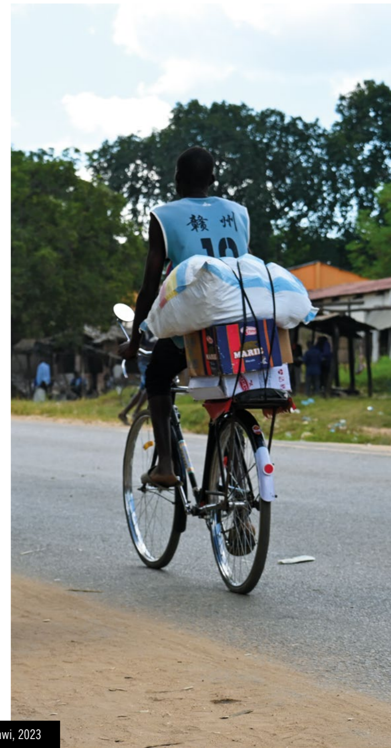
As seen on route to the Mwanza trade post. Amnesty International, Malawi, 2023

Following a brief economic boom during the first few years after independence in 1980, Zimbabwe's economic growth was stunted by a number of issues, namely, declines in prices for minerals and other key exports, a series of consecutive droughts, and reduced foreign investment. 111 As a result, levels of public debt mounted, and the economy was plunged in a recession. 112 Following the policy prescriptions of the World Bank and IMF, in 1990 the Zimbabwean government adopted its first economic structural adjustment programme, encapsulated in the 'Framework for Economic Reform: 1991-1995'. Rather than meeting its stated objectives to stimulate economic growth, Zimbabwe's Economic Structural Adjustment Programme triggered soaring rates of inflation. 113 By the year 1998 real wages in formal jobs had declined significantly and thus, working-aged Zimbabweans, grappling with reduced incomes and insufficient opportunities in formal employment, turned to informal work for survival. 114 Political instability, international sanctions and the progressive deterioration of the rule of law only served to exacerbate this challenging economic environment and has contributed to Zimbabwe's current position as one of countries with the highest incidence of informal work in the world. 115