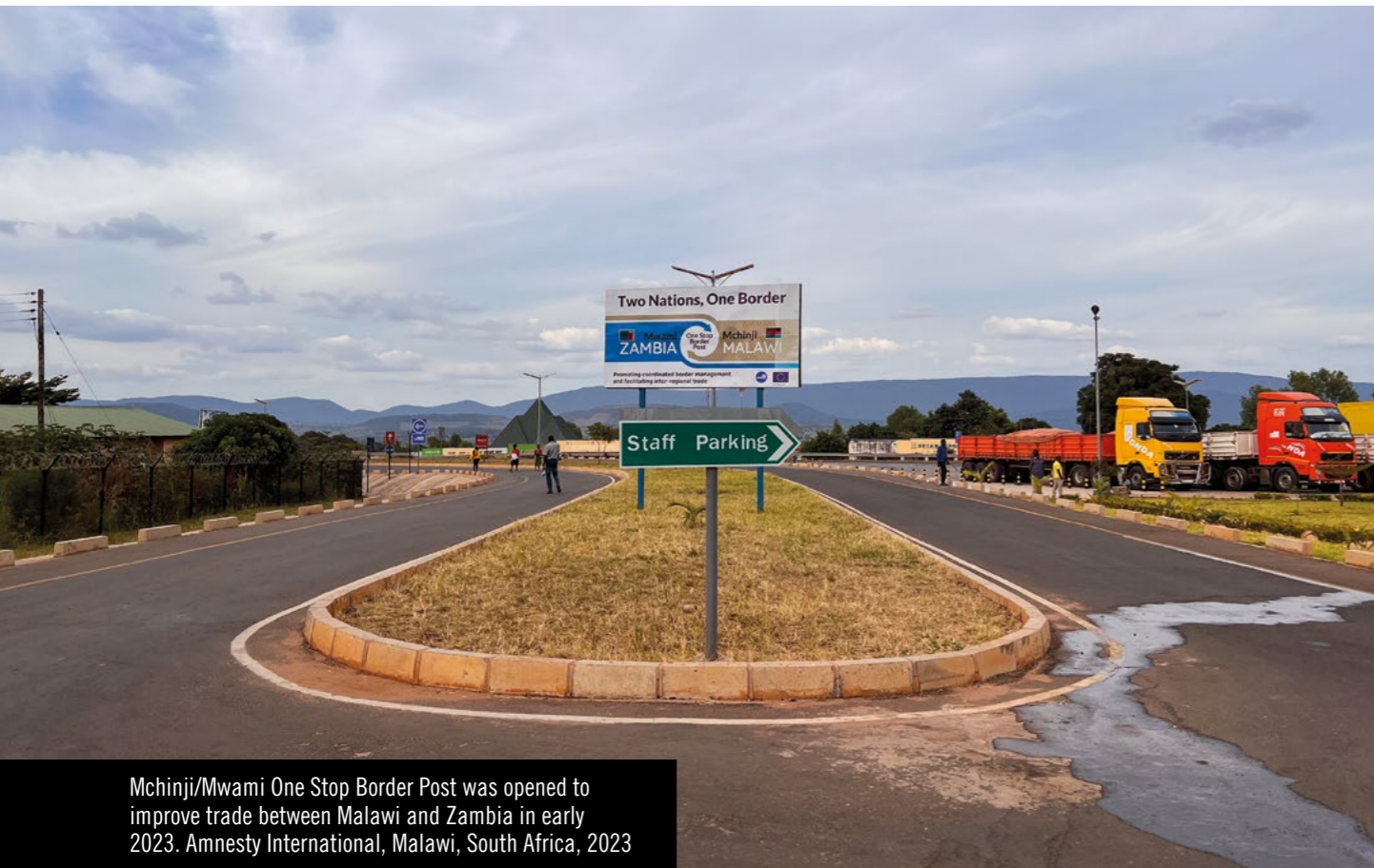
Mchinji/Mwami One Stop Border Post was opened to improve trade between Malawi and Zambia in early 2023.

Additionally, women cited corruption among the police as a significant barrier, with one woman stating, “Police work with the robbers. I can’t report because of intimidation; the police are there, it’s a police officer who will be harassing me.” 323