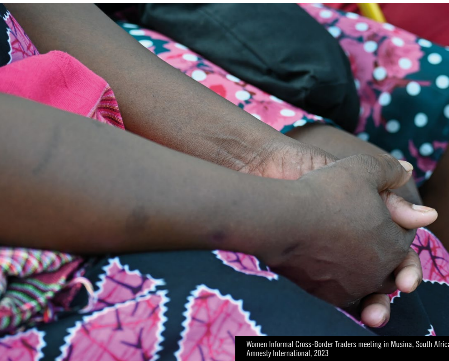
Women Informal Cross-Border Traders meeting in Musina, South Africa. Amnesty International, 2023

coming largely from marginalized backgrounds marked by poverty. Ethical considerations observed by Amnesty International researchers included ensuring informed consent, use of pseudonyms, and modest travel cost reimbursement for interviewees. Findings from interviews were complemented by desk research. Amnesty International sent right of reply letters to relevant government ministries in profiled countries.