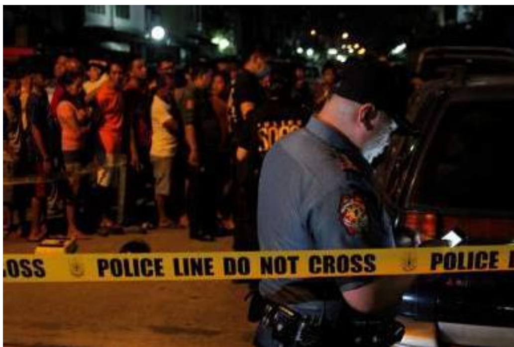
A policeman waits at the scene of an anti-drug police operation, 17 August 2017, Manila.