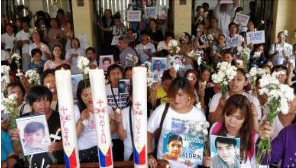
Families of victims of extrajudicial executions gather at the Shrine of Jesus Parish, 15 March 2019, Quezon City, Metro Manila. They were holding a prayer and rally demanding justice for the victims.