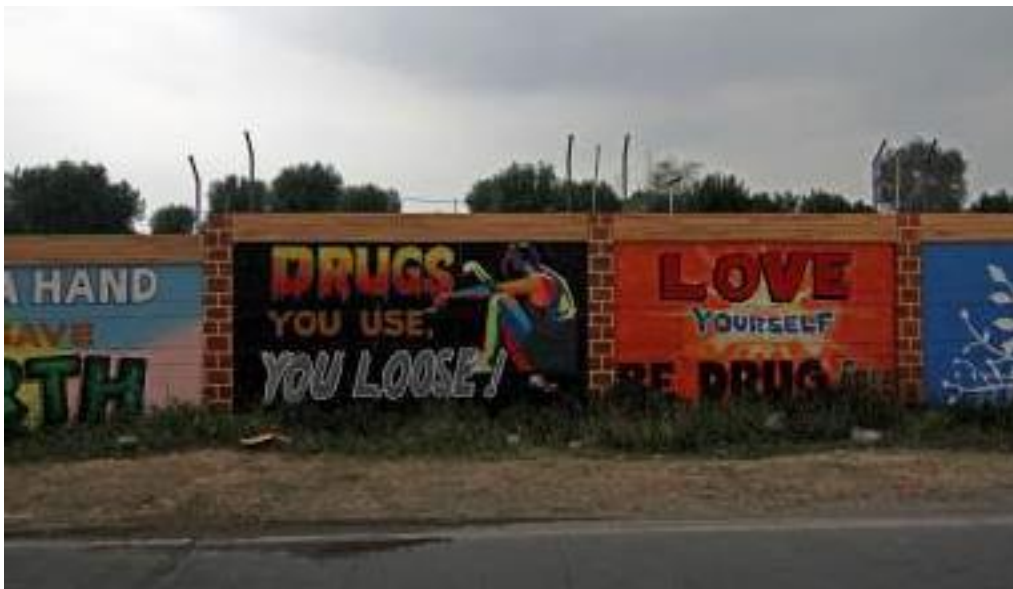
In this photo taken 18 April 2019, murals supporting the government's anti-drug campaign can be seen in Bocaue, Bulacan.

Mandatory drug testing is an arbitrary interference with an individual's privacy and is counterproductive from a right to health perspective, since it deters people from seeking the help they may need. Moreover, the consequences of having a positive result after a drug test can be deadly, as Feria attested. Far from allowing people using drugs to seek help, the requirement for them to expose themselves to local authorities and others so publicly has increased stigma and demonisation of people using drugs further.