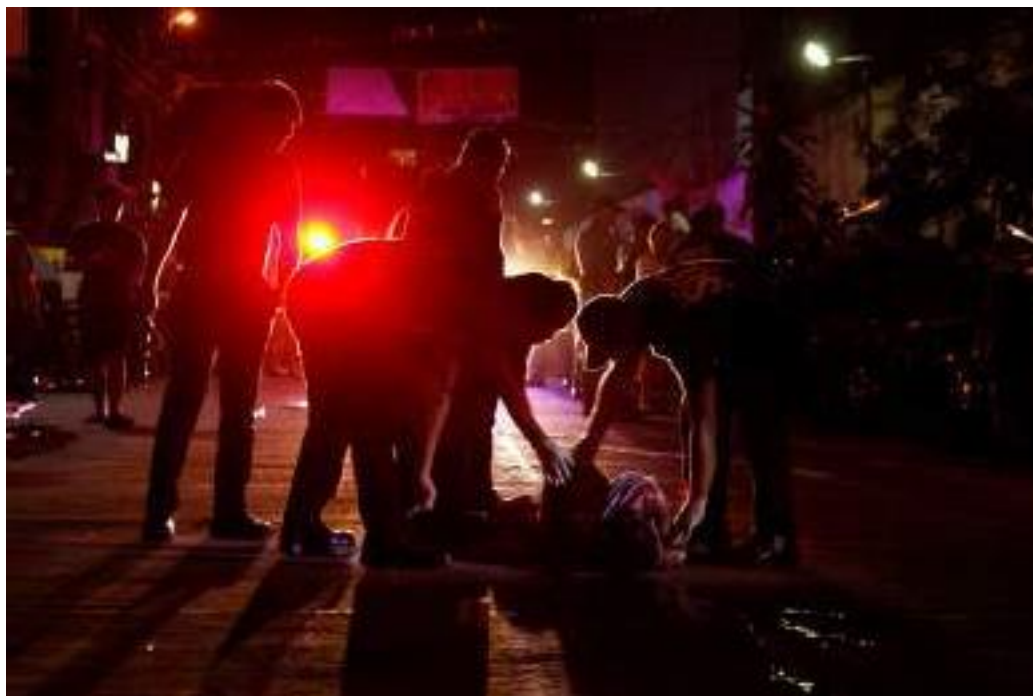
Crime scene investigators handle the body of a man killed by unknown armed persons, 11 May 2018, Caloocan City, Metro Manila. Local officials said the man was on a “drug watch list.”

A former public safety officer who had served in various security roles in their community for more than a decade told Amnesty International that in their experience, “drug personalities” with connections do not end up on these lists. “I know a big-time pusher [in our area], but his name is not on the list,” they said. 117 Documentation by Amnesty International and others, as well as extensive media reports suggest that this is not unusual and that the vast majority of those on the lists are poorer, more marginalised members of the community.