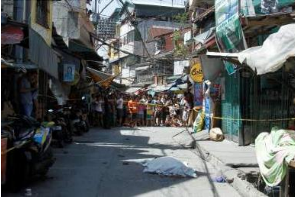
Onlookers gather behind police crime scene tape at the site of the killing of a man who was shot by unknown armed persons, 21 March 2019, Malabon City, Metro Manila. A sign reading "Don't emulate me, I'm a [drug] pusher" was left on the body.