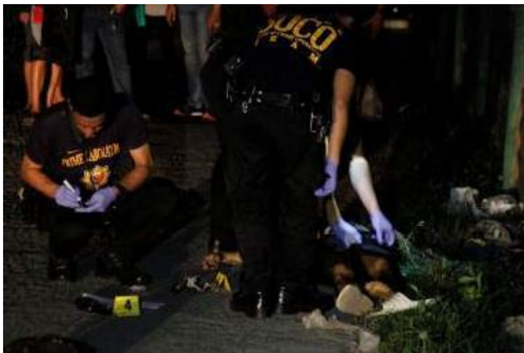
Crime scene investigators inspect the site of the killing of two men shot dead in an alleged "buy-bust" police operation on 1 July 2018, Caloocan City, Metro Manila. In all 18 incidents of killings by the police documented in this report, the police said the case involved a "buy-bust" operation in which undercover operatives were buying drugs from a "suspect," a description employed even in incidents where families and witnesses spoke of an all-out raid, rather than a sting operation.

Families of victims who are predominantly poor continue to suffer considerable mental anguish and economic hardships as a result of the killings. Many interviewees described a climate of fear in which they are constantly worried about their loved ones going out at night lest they be framed by the police at checkpoints or elsewhere.