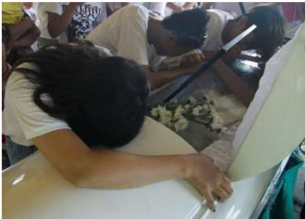
Family members and friends of a man killed by the police mourn over his casket during the funeral, December 2018, location withheld. The father of three was killed by the police a month prior in the province of Bulacan in an alleged "buy-bust" operation, the circumstances of which are disputed by family members.

In a survey conducted in December 2018 by a leading Philippine independent research institution, 78% of Filipinos said they worried that they or someone they know would become the victims of extrajudicial executions. 77 Commenting on the findings of the survey, a presidential spokesman was quoted as saying, "If they (Filipinos) are not involved [in drugs], they do not have to be afraid." 78