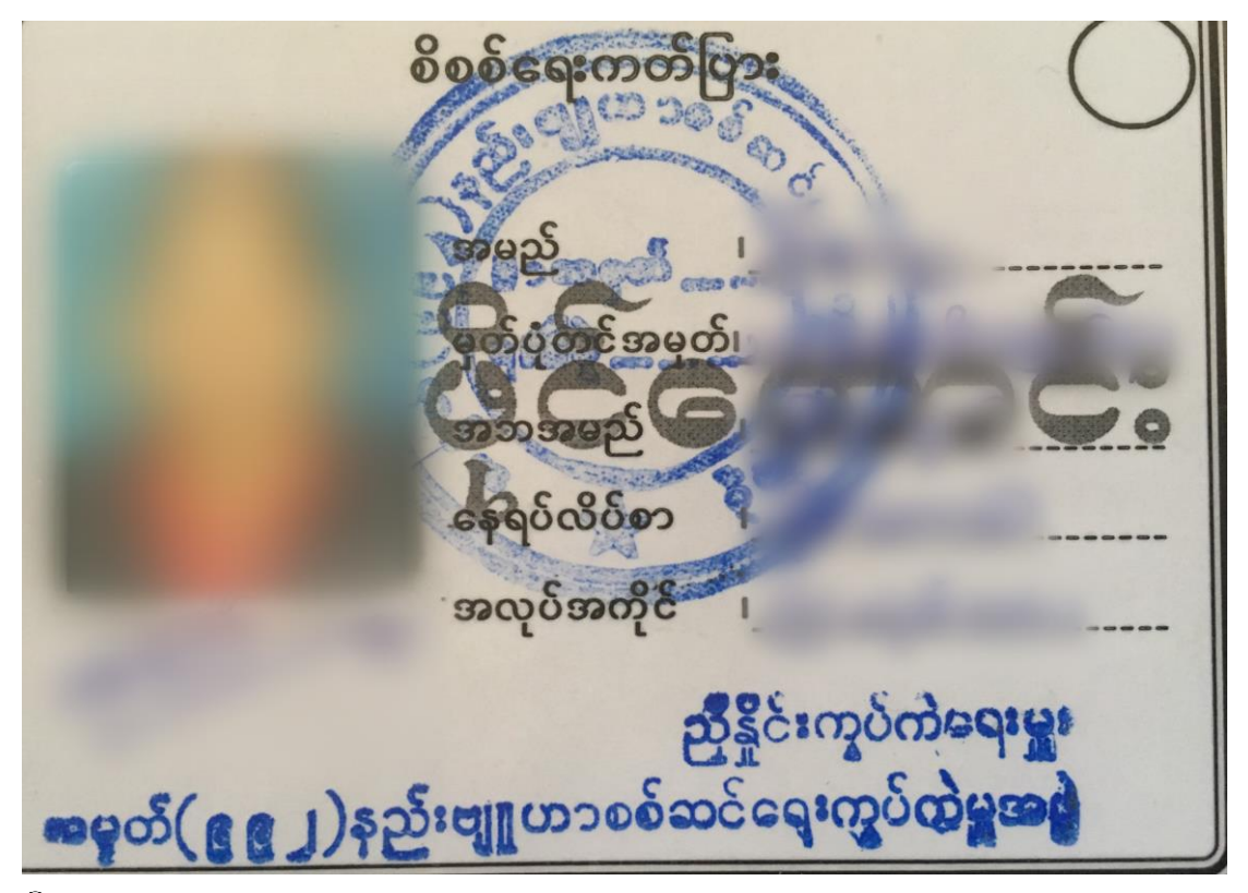
A special identification card issued by Myanmar authorities in early 2017 to residents of villages between Pang Hseng and Monekoe towns. Anyone caught outside a camp or home without the identification card faced arrest and detention by the Myanmar security forces.

A Myanmar expert said that the ordered or de facto clearance of villages, and the pressure on local communities more generally, represented a continuation of abusive counterinsurgency tactics that the Myanmar Army has deployed for decades.<sup>173</sup> The impact these tactics have in terms of depriving people of their livelihoods are compounded by the restrictions on humanitarian access, discussed in detail below, and have dangerous medium- and long-term implications on people's standard of living, including access to adequate food and their physical and mental health.<sup>174</sup>