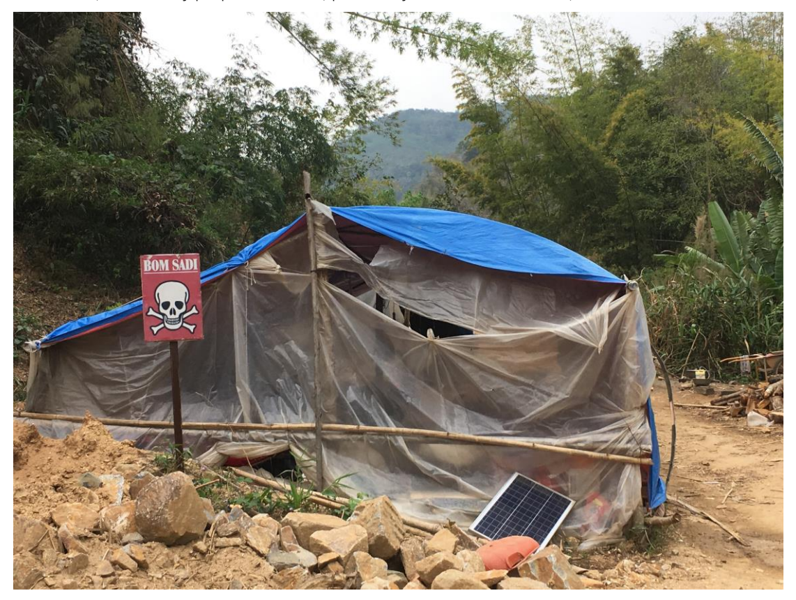
* Signs erected by the Kachin Independence Army warn of landmine-related devices in the area. The widespread landmine contamination in Kachin and northern Shan States, combined with poor demarcation and mine safety education, results in many civilians being injured or killed, simply when walking to their farms or along the road.

The Myanmar Army and some ethnic armed groups have failed to meet these obligations, leading to civilians being killed or seriously injured simply while walking on roads or trying to work on their farms. Although Amnesty International delegates saw signs in KIO-controlled territory that warned of landmine-riddled areas, and heard of similar signs in specific parts of government-controlled territory, landmine-related victims, community leaders, and local humanitarian officials all said that such signs are in only a small percentage of areas where there are landmines or IEDs. Signs placed by the Myanmar Army are also typically only written in Burmese, which many people in the area, particularly from ethnic minorities, cannot read.<sup>289</sup>