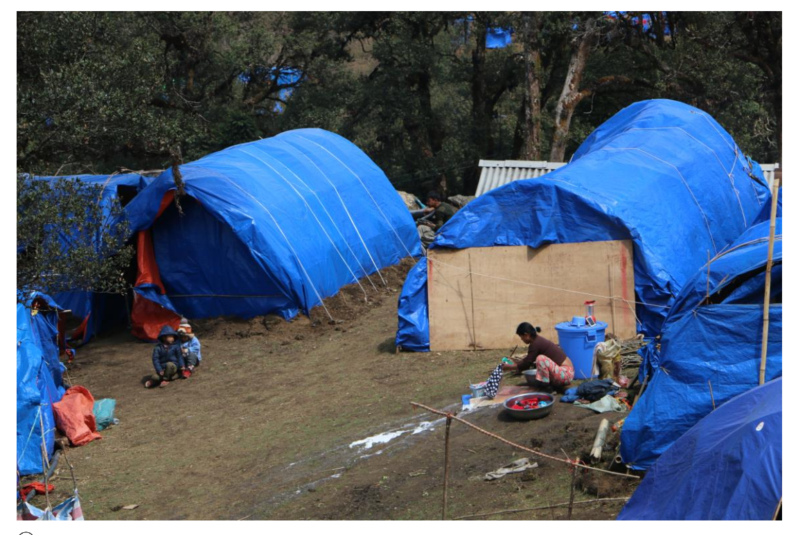
* A Sha It Yang IDP camp, which houses more than 2,000 people displaced by the conflict. Most of those at Sha It Yang lived previously at Zai Awng IDP camp, until mortars fired by the Myanmar Army exploded nearby on 27 December 2016.

After several more days sleeping along roads and in the forest in Myanmar, most people were taken to a new camp, known as Sha It Yang. At an elevation of more than 2,000 metres, and without proper shelter, people found themselves ill-prepared for the winter snow and freezing nightly temperatures. Many fell sick, some of them seriously enough they had to be transported to clinics in Laiza and moved to other IDP camps. Responding to the dire needs of those displaced from Zai Awng was compromised by the Myanmar government and military's restrictions on humanitarian access, discussed in more detail on page 33.