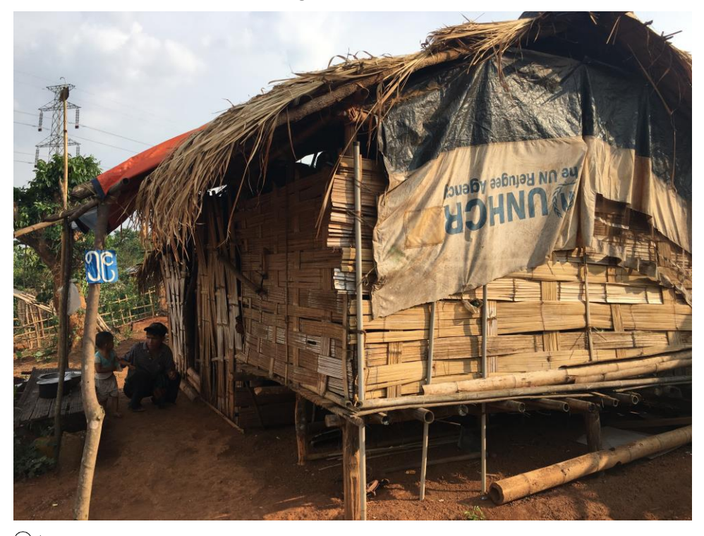
A home in an internally displaced persons (IDP) camp just outside Namtu town in northern Shan State. Heavy fighting in the area through May 2017 has forced many people to flee surrounding villages.

Several activists and humanitarian officials in Kachin State said that forced portering and guiding by the Myanmar Army continues there as well. Two activists said it was perhaps less pervasive now than in 2011 and 2012, in part because villages in conflict areas are largely emptied and in part because improved roads in Kachin State means the Myanmar Army can transport soldiers and materials by truck more than in the past.<sup>89</sup> In northern Shan State, however, the practice remains ubiquitous, particularly in more remote conflict areas. Forced portering and guiding violates international human rights law, including provisions of the Forced Labour Convention, which Myanmar has ratified.<sup>90</sup> Forced labour that compels people to take part in military operations, which would include forced portering and forced guiding, is also a violation of customary international humanitarian law, including for non-international armed conflicts.<sup>91</sup>