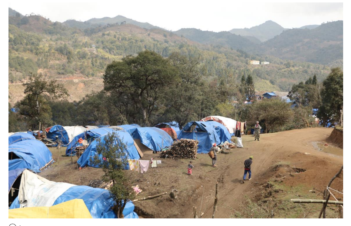
^{(1)} ^{(2)} Sha It Yang IDP camp, which houses more than 2,000 people displaced by the conflict.

Humanitarian officials explained that access restrictions cause four specific problems for responding quickly to displaced peoples' needs related to shelter, water, and sanitation. First, the restrictions make it harder for any organization to bring certain materials, like timber or bamboo, to NGCA. Second, since international organizations are denied access, the burden falls entirely on a few local organizations; given the demands, they are overstretched. Third, while international organizations can fund and help instruct local organizations on tasks like building water pumps or latrines, they are not able to inspect for quality assurance, as they normally would.<sup>187</sup> This lack of presence also affects protection monitoring. "It is hard for us to assess the situation, protection by presence is important," said an international aid worker. "It needs to be official." <sup>188</sup>