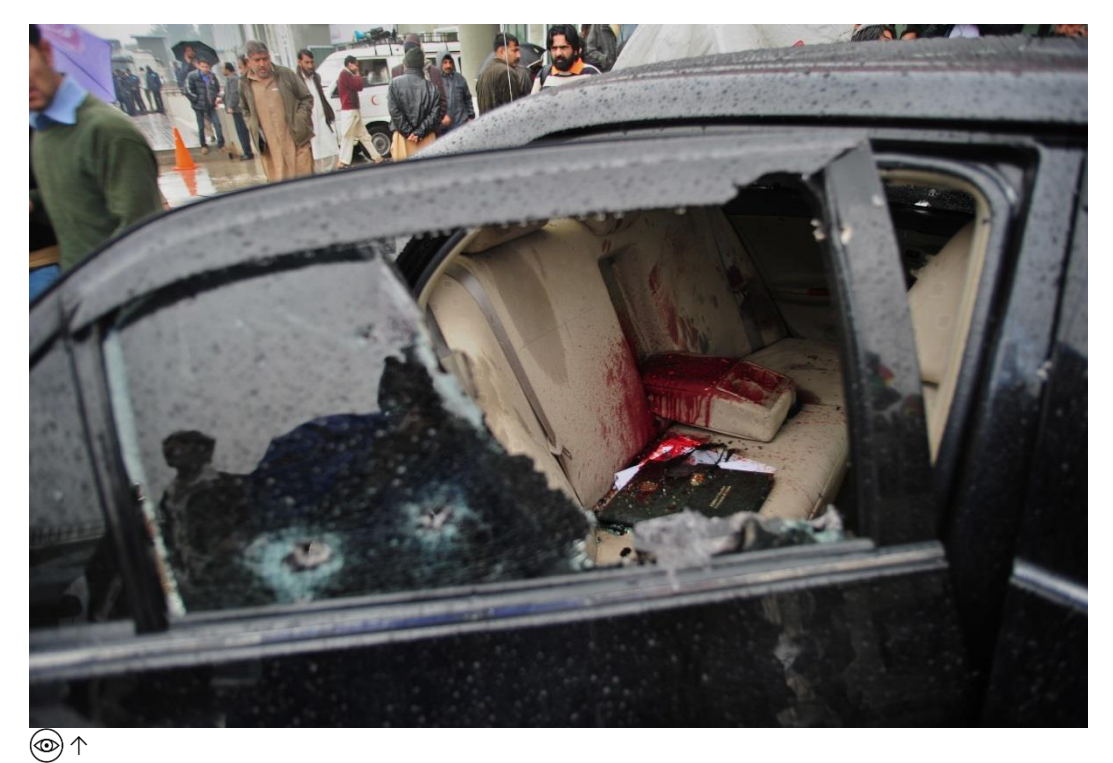
The blood-stained car of Pakistani Minorities Minister Shahbaz Bhatti is seen following an attack in Islamabad on March 2, 2011. Gunmen shot dead a Catholic Pakistani government minister on 2 March, after he had vowed to defy death threats following the murder of another politician opposed to an Islamic blasphemy law.

Despite only a few cases where senior members of the Punjab government have intervened or the police has responded in time to prevent abuses, the state has, more often than not, failed to protect individuals and groups. Article 6 of the ICCPR underlines that everyone has the right to life which must be protected by law. This places a positive obligation on Pakistan to protect against threats to life by non-state actors, including those who commit violence in the name of religion. In some cases, the authorities' failure to prevent and promptly prosecute those responsible for mob violence has the effect of legitimizing a culture of vigilantism.