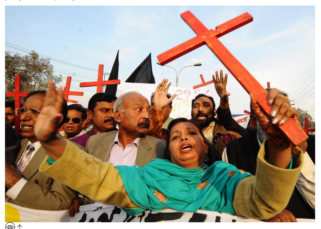
Members of the Pakistan Christian Democratic alliance march during a protest in Lahore on December 25, 2010, in support of Asia Bibi, a Christian mother sentenced to death under blasphemy laws. Bibi was arrested in June 2009 after Muslim women labourers refused to drink from a bowl of water she was asked to fetch while out working in the fields. Days later, the women complained that she made derogatory remarks about the Prophet Mohammed. Bibi was set upon by a mob, arrested by police and sentenced on 8 November 2010.

The high court judgment stated "the prosecution has proved the charge against her through direct unimpeachable evidence" relating to the allegations. The judgment also considered a defence argument based on the delayed filing of the FIR as "immaterial especially when the direct evidence, produced by the prosecution, is consistent, coherent and confidence-inspiring because such delay only becomes significant where the prosecution evidence and other circumstances of the case tend to tilt the balance in favour of the accused." Instead, the high court commented that "extra care and caution was taken by the complainant prior to reporting the matter to the police due to the seriousness and gravity of the same." The judgment in Asia Noreen's case also cited a previous high court judgment which asserted that the statement of even a single witness that somebody uttered contemptuous words about the Prophet Muhammad is sufficient to justify the death penalty.