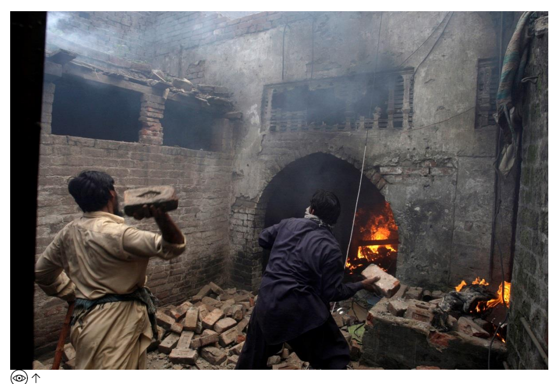
Pakistani men, part of an angry mob, throw bricks at a Christian house after setting it on fire, in Lahore, Pakistan, Saturday, March 9, 2013. A mob of hundreds of people in the eastern Pakistani city of Lahore attacked a Christian meighborhood Saturday and set fire to homes after hearing accusations that a Christian man had committed blasphemy against Islam's prophet, said a police officer.

In their statements submitted to the court as part of trial court proceedings against alleged participants, the police claim they tried their best to stop the mob. The station house officer of the local police station stated that the superintendent of police "tried to make the crowd understand but the people did not stop and started pelting stones on police ... the crowd started firing on the police ... The [superintendent] first ordered use of tear gas and then aerial firing. Meanwhile, the police were encircled on three sides and the assailants started putting houses on fire."