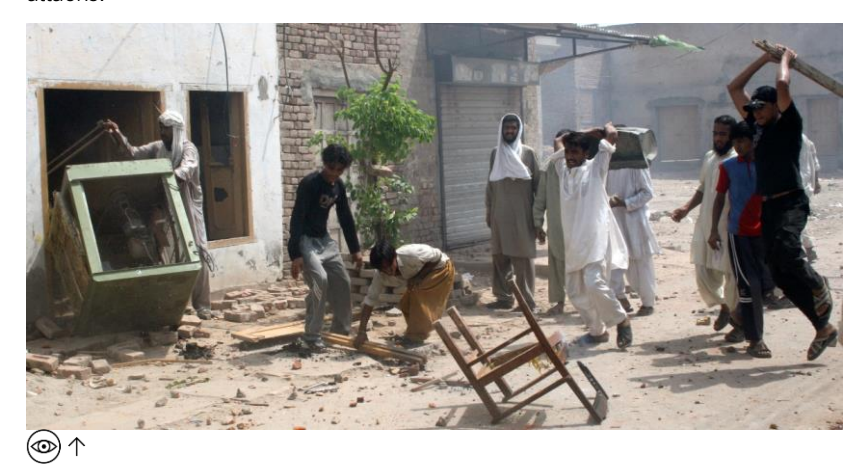
A mob of Muslim men take part in a violent protest against Christians on the street in Gojra town in Pakistan's central Punjab province 1 August 2009. Six Christians, including four women, were burnt alive in clashes with majority Muslims in a town in central Pakistan on Saturday, officials said.

The cases presented in this chapter illustrate the lack of a consistent, robust and timely response by the authorities to situations of developing mob violence, which forces people from their homes and can lead to death and destruction of property. The lack of such a response, and the failure to prosecute rigorously and promptly those responsible, leads to a climate of impunity which can provide fertile ground for further such attacks.