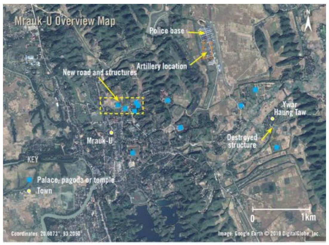
The overview map shows the historic town of Mrauk-U. A structure in Ywar Haung Taw appears destroyed and new artillery is visible at the police base to the north of the city. The town is dotted with ancient palaces, pagodas, and temples with only a few larger ones marked on the map above, A new road and structures are visible close to many of the pagodas and temples.

The expert on the archaeological site explained that they had not been able to access the site to undertake a detailed assessment of damage and destruction because the military remains in positions around the area. However, the expert raised a number of concerns about the impact of fighting on the historical temples and monuments including: physical damage resulting from gunfire and mortars; structural damage caused by vibrations from repeated firing of artillery in close proximity to the site; the use of the site – and possibly materials from the site – to build bunkers; and the burning of vegetation in the surrounding area.<sup>89</sup>