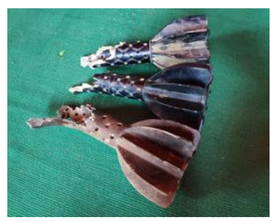
120mm and 60mm mortar tailbooms found in Ywar Haung Taw village, Mrauk-U Township, photographed 20 March 2019

A statement posted on the website of Senior General Min Aung Hlaing, Commander-in-Chief of the Myanmar military, claimed that "AA terrorists attacked a military convoy while the convoy was marching into Mrauk U town for security" and that "AA terrorists took cover in civilian houses." The AA denied being engaged in any fighting in Mrauk-U town that evening; although admitted to attacking a Myanmar military convoy around 30km away earlier that day. 58