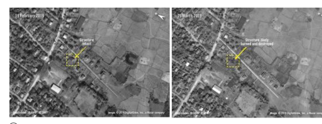
Imagery above shows the probable burning and destruction of a structure in Ywar Haung Taw village. The panchromatic imagery inhibits the ability to determine if the structure was razed by fire but it does appear to have been destroyed.

Amnesty International obtained photographs, taken on 20 March, of mortars villagers claimed to have found in Ywar Haung Taw following the attack. A military expert at Amnesty International confirmed they were the tailbooms of 120mm and 60mm mortars, noting the matching colour and stencilling; all were likely made in Myanmar. The distinctive shape and number of fins is similar to those of mortars photographed by Amnesty International in northern Myanmar in 2017.56