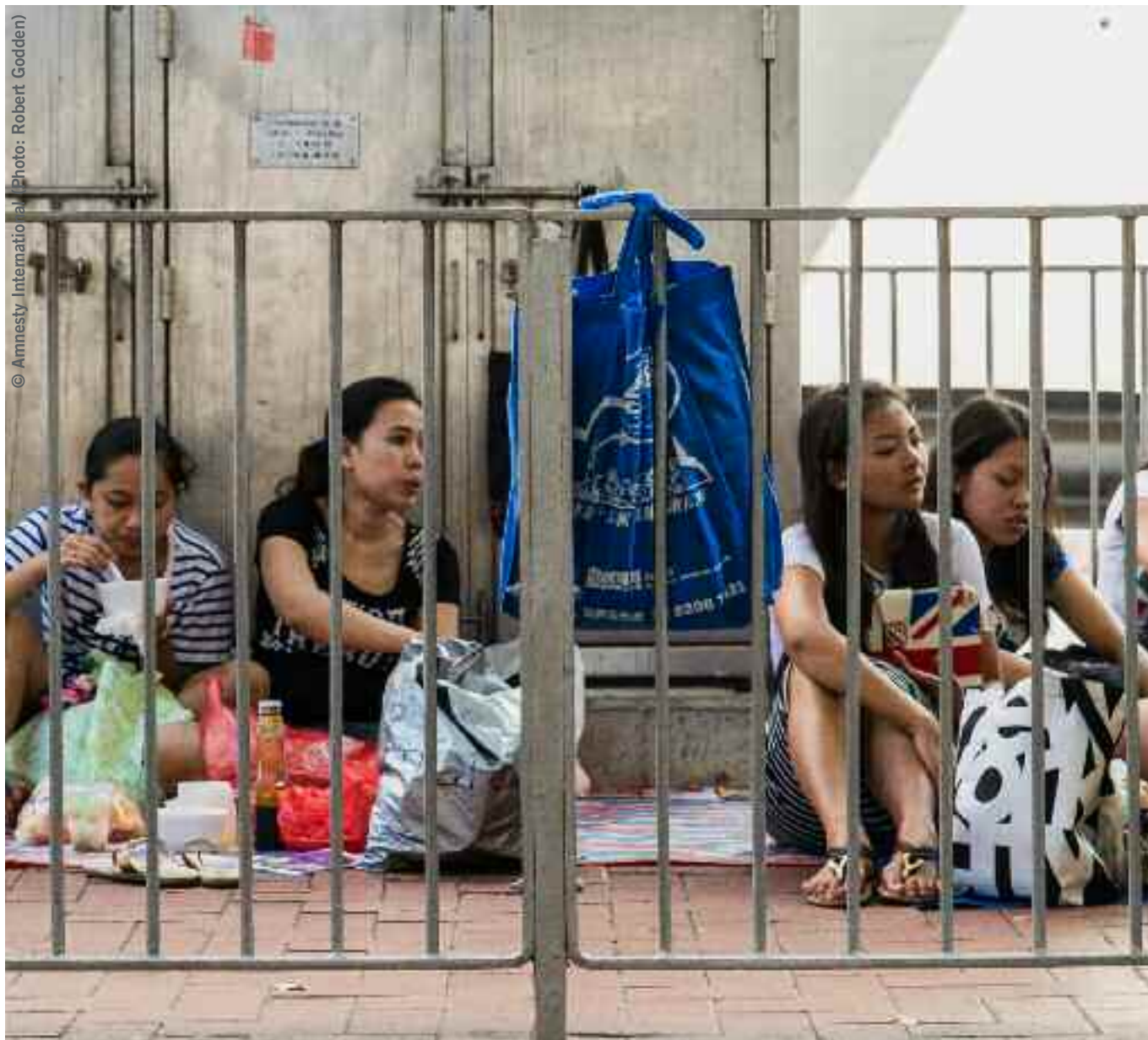
Indonesian migrant domestic workers during their statutory rest day in Victoria Park, Causeway Bay, Hong Kong, June 2013.

Almost 4 million Indonesians have officially migrated abroad for work since 2006. The majority of them are women who take on domestic work in private homes. Poverty and unemployment compel them to seek opportunities abroad, including Hong Kong. Yet for many Indonesian migrant domestic workers, hopes for a better life are crushed by a migration process that is fraught with duplicity and abuse from the moment they enter it.