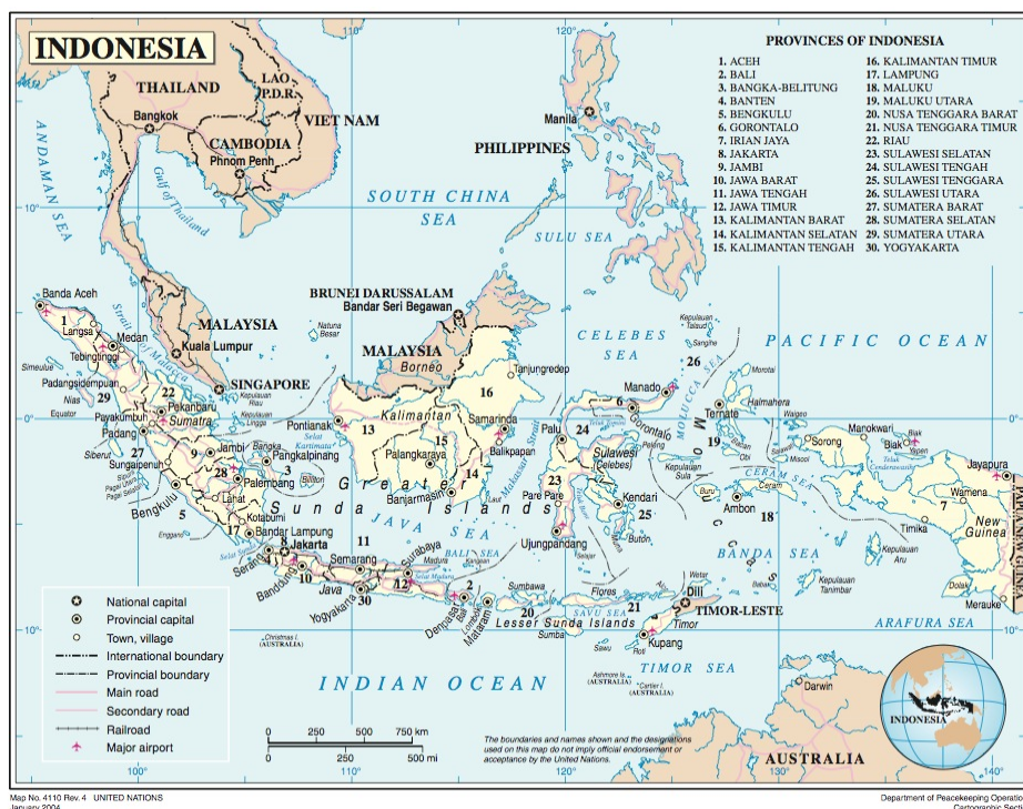
Figure 12: Map of Indonesia