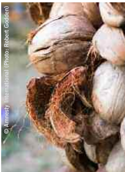
© Amnesty International (Photo: Robert Godden)