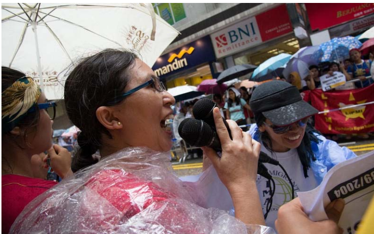
Figure 9: Migrant domestic workers protesting in front of the Indonesian Consulate

"When I went to the placement agency to complain about the deductions, they said that this was a pre-arranged agreement set by the recruitment agency in Indonesia. I complained three times but they didn't help me at all. After each attempt, I followed up by going next door to the Indonesian Consulate. But on all three occasions, the staff refused responsibility by saying that this was an agreement between the Hong Kong and Indonesian agencies so they could not intervene to help me." 392