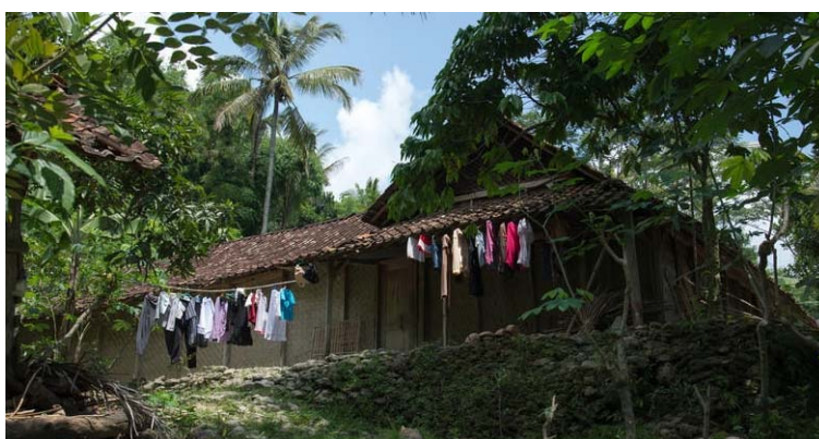
Figure 3: A migrant domestic worker's rural home in East Java

"My broker promised to give me IDR 5,000,000 [US$510] if I agreed to go abroad with the recruitment agency he recommended, but I never received the money. The broker also promised that I would be at the training centre for three months, but instead I was there for 10 months." 67