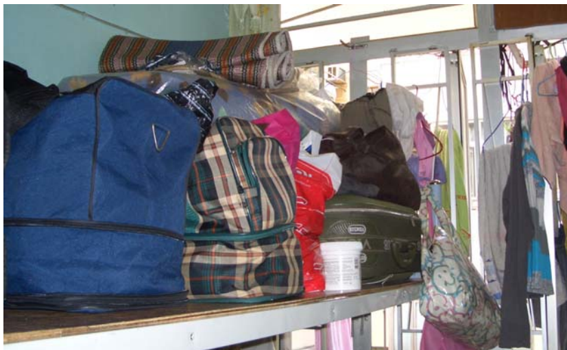
Figure 8: A bedroom at an Indonesian shelter also used to store personal effects of domestic workers

HM sought compensation for the food allowance, as she was only given one full meal per day, and rest days that she was denied. During the conciliation process at the Labour Department in September 2012, HM did not accept the compensation offered by the employers, thus, her case went to the Labour Tribunal where it was pending at the time of the interview. 363