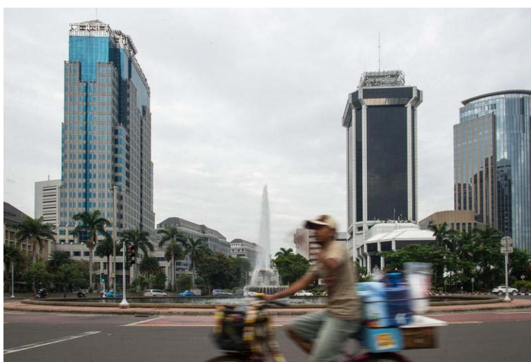
Figure 4: Many women go to Jakarta for training before working as domestic workers in Hong Kong

In view of the above, it is not surprising that many interviewees were made to pay for some items or services (e.g. books, uniforms, medical exam and competency test), which are already included in the official recruitment fee – effectively being double charged. Eleven women Amnesty International spoke with reported that they also had to purchase some of these items at the training centre, where the price was more expensive than elsewhere. Most remarked that they had “no choice” but to buy them at the training centre, as they were not permitted to leave because they are unable to provide collateral (see section 4.3). The IMWU survey found that 69 per cent of those interviewed were required to purchase books, stationery, uniforms and other items directly from the recruitment agency at inflated prices 107 and 14 per cent had to pay an additional fee to sit their competency exam. 108