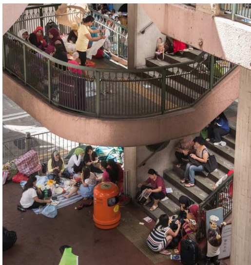
Figure 6: On Sundays, many Indonesian domestic workers gather at Causeway Bay, Hong Kong

The mandatory live-in requirement increases workers’ isolation and the consequent risk of being subject to exploitation and abuse. An option to live outside of the house would provide migrant domestic workers with a way out of situations where their basic rights are being violated (e.g. where their privacy is not being respected and/or they are at risk of abuse from someone in the employer’s household or where they are being made to work excessive hours). It is also likely that migrant domestic workers would gain leverage in negotiations for better conditions of work if they had the option of leaving the employer’s house.