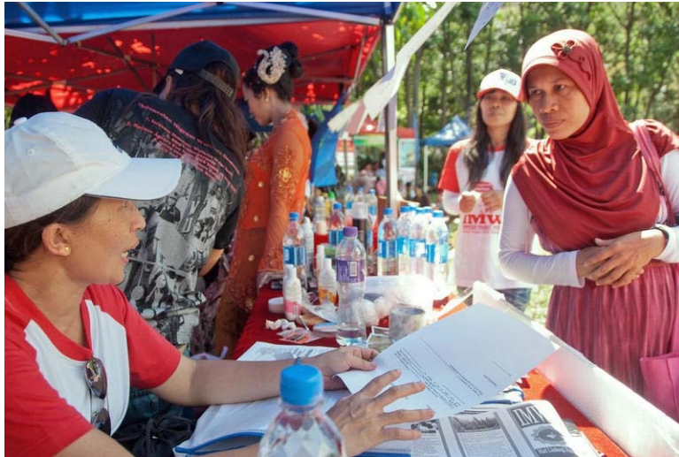
Figure 7: IMWU activists at an information stall in Hong Kong's Victoria Park