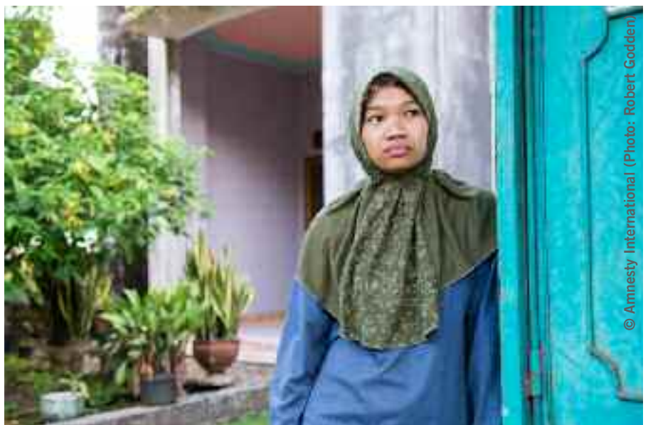
© Amnesty International (Photo: Robert Godden)