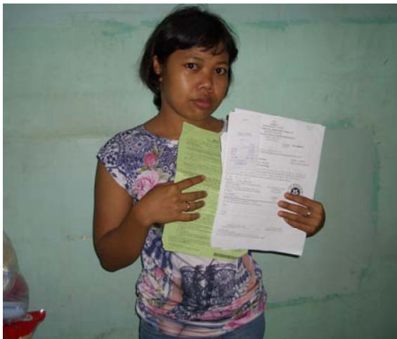
Figure 10: Upon completion of her case, an Indonesian domestic worker holds up her contract and Labour Tribunal documents

The cumulative effect of the policies and practices described above and in previous sections is to seriously impede Indonesian migrant domestic workers from pursuing compensation and accessing justice in Hong Kong. This is reflected in the fact that 43 per cent of respondents to the IMWU survey stated that they did not file a complaint even when they had a problem. 413