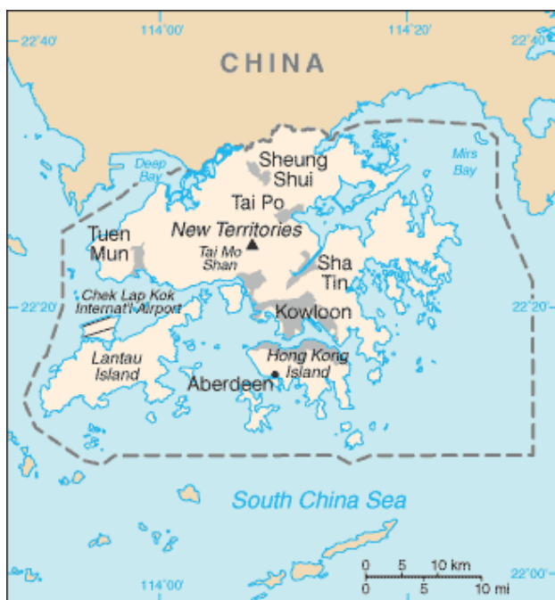
Figure 13: Map of Hong Kong SAR