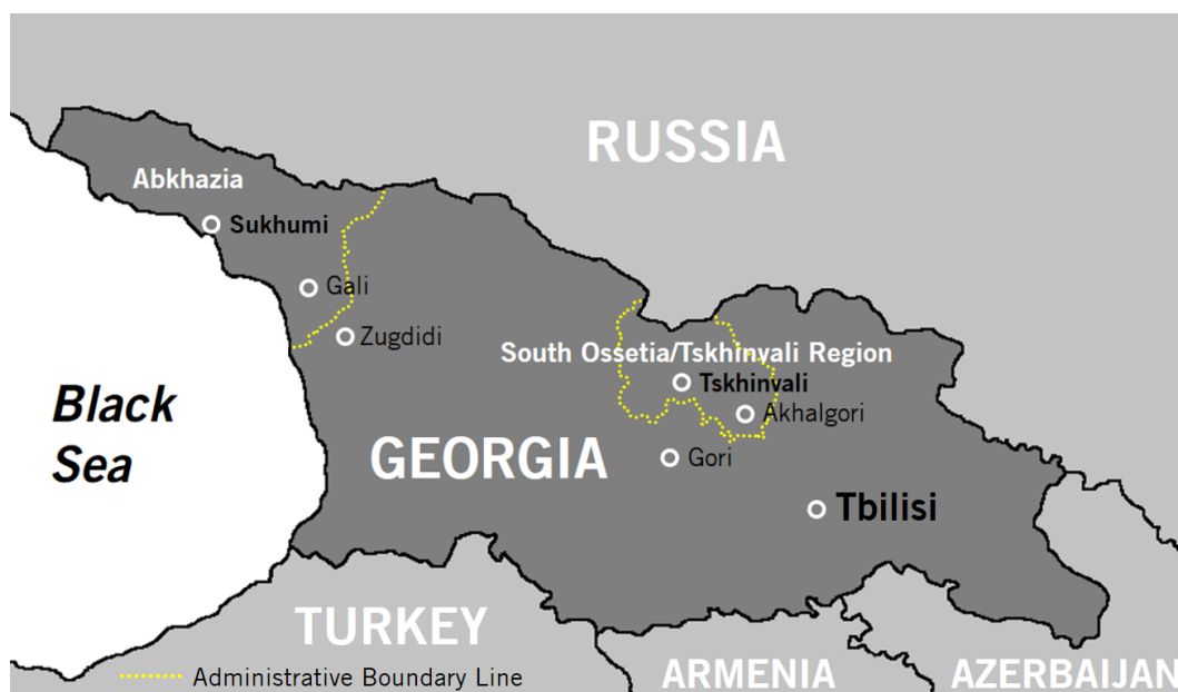
MAP OF THE REGION

Starting in the late 20 th century, the rise of ethnic nationalism in Georgia and its push for independence from the Soviet Union increased ethnic tensions between Georgians on the one hand and Abkhaz and Ossetians – minority ethnic groups with autonomous regions in what was then the Georgian Soviet Socialist Republic – on the other. 2 Various measures taken over the years exacerbated each side's perception that they had been discriminated against by the other. Ethnic tensions culminated in Abkhaz and Ossetian demands for secession from Georgia in the run-up to the breakup of the Soviet Union in the late 1980s. Tensions between these aspirations for greater independence, and the desire of the Georgian government to preserve the republic's territorial integrity, escalated into armed conflicts in both breakaway areas in the early 1990s. By 1994, when ceasefires in both areas were in force, Georgia had lost control of most of Abkhazia and parts of South Ossetia/Tskhinvali Region. Joint peacekeeping forces of Georgian, Russian, and Ossetian troops were stationed in South Ossetia/Tskhinvali Region, while Russian peacekeepers were established in Abkhazia.