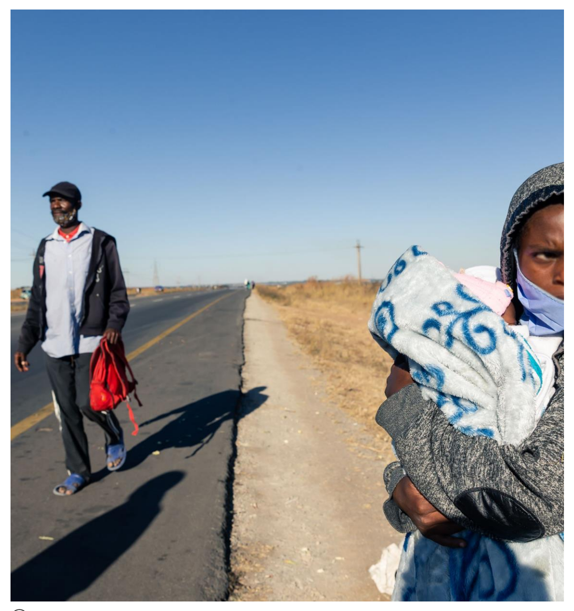
A stranded mother carries her child by a road with little traffic as she awaits transport to get into the central business district of Harare on June 2, 2020. -Zimbabwean security forces on June 2, 2020, cleared Harare's city centre and turned back thousands of commuters and motorists as authorities reinforced restrictions to combat the spread of the COVID-19 coronavirus following a spike in new cases

failing to access prenatal care services, due to the public transport ban.<sup>239</sup> Bernard Madzima, the former Director of the Department of Family Health in the Ministry of Health and Child Care told the Standard Newspaper that it was possible that expecting mothers were failing to access hospitals because the authorities had not put in place adequate measures to assist them. He said, "Definitely there will be issues of complications in terms of unavailability of transportation during the lockdown period and it will need community efforts to ensure that a pregnant woman who needs to get to a health facility manages to do so".<sup>240</sup>