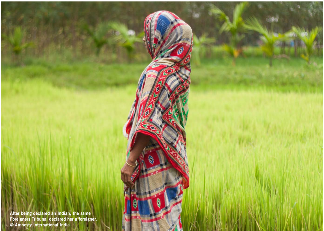
After being declared an Indian, the same Foreigners Tribunal declared her a foreigner.