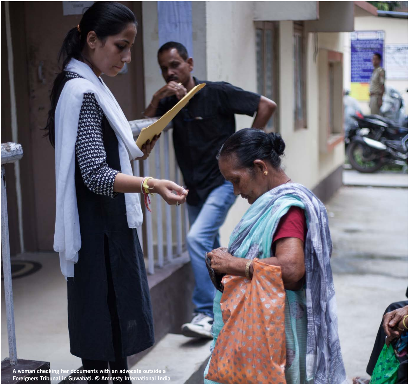
A woman checking her documents with an advocate outside a Foreigners Tribunal in Guwahati.

On 29 July 2015, 63 persons were selected to be Members, of which only two were former or serving judicial officers. After a training session spanning across only 4 days, all the members were deputed to their respective posts across Assam.