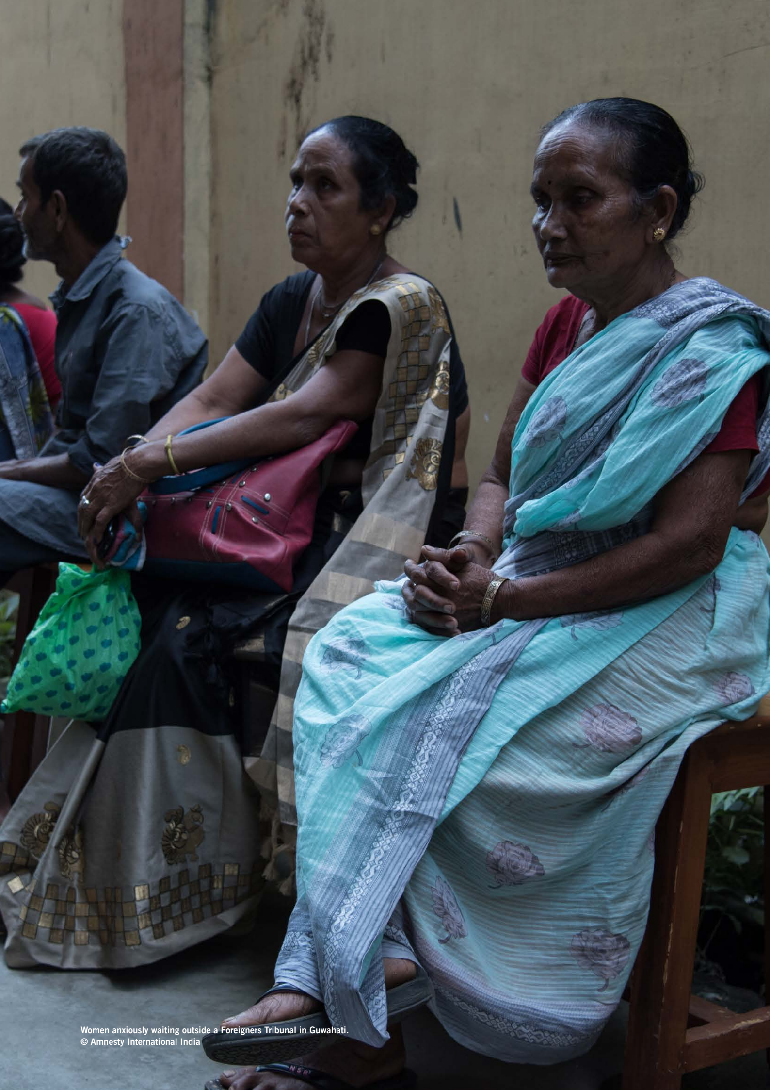
Women anxiously waiting outside a Foreigners Tribunal in Guwahati.