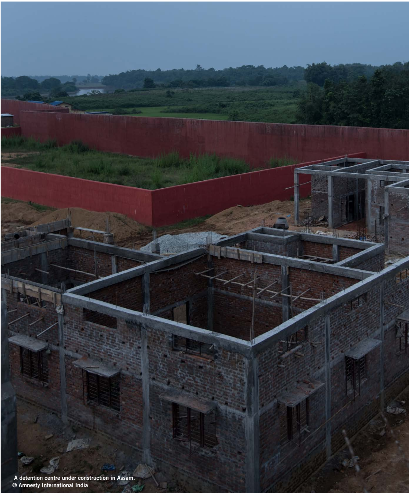
A detention centre under construction in Assam.