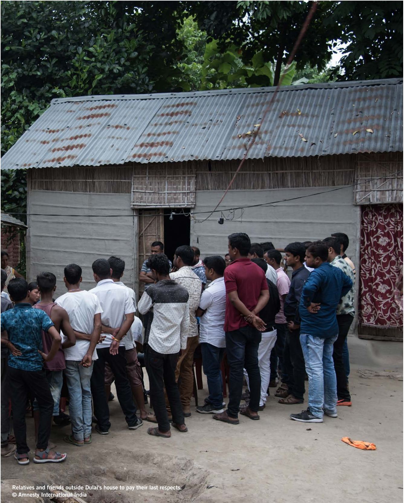
Relatives and friends outside Dulal's house to pay their last respects.

The procedures before the Foreigners Tribunal do not consider the unique vulnerabilities of people who approach the Foreigners Tribunal. For instance, there are no provisions of mandatory legal aid for people suffering from mental illnesses. Often, their mental condition is not considered before depriving them of their nationality and liberty.