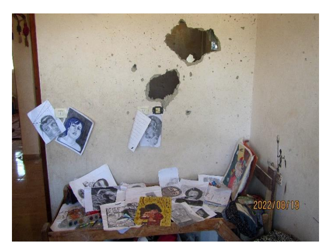
Duniana al-Amour's artwork in her bedroom, damaged after a projectile punctured holes in the wall and took her life on 5 August 2022

The weapon's accuracy, the round's penetration of a wall of the al-Amour family's house, the significant distances between the al-Amour family's house and the closest watchtowers (relative to the weapon's precision), and the fact that the Izz al-Din al-Qassam Brigades' tower was not hit or damaged even though it was much closer to the Al-Quds Brigades' tower than the Al-Amour family's house lead Amnesty International to believe that Israeli forces deliberately targeted the al-Amour family's house.