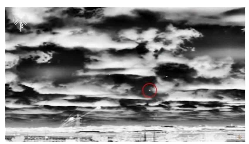
Snapshot of a video published by Israeli army on 6 August 2022 claiming to show a barrage of Palestinian rockets being fired and to identify, with a red circle, a rocket that misfired

On 6 August 2022, at 9.02pm, just as the night-time call to prayer was sounding from the loudspeaker of a nearby mosque, a rocket killed seven Palestinian civilians, including four children, and wounded at least 15 others in Jabalia refugee camp. The rocket damaged dozens of houses on both sides of Trance Street, a main road in the camp. The seven Palestinians killed in the attack were: Momen al-Neirab, aged six; Hazem Salem, aged eight; Ahmad al-Neirab, Momen's brother, aged 12; Ahmad Farram, aged 16; Khalil Abu Hamada, aged 18; Muhammad Zaqqout, aged 19; and Nafeth al-Khatib, aged 50.