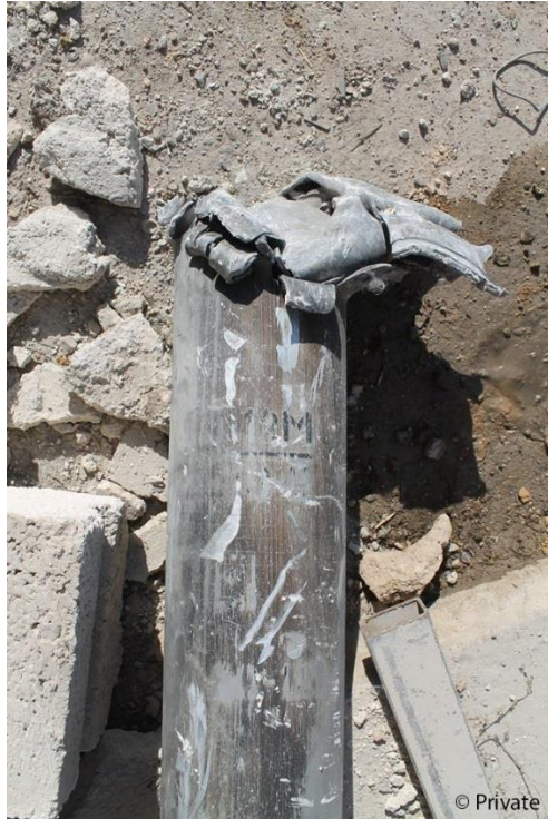
Remnant of a rocket that hit the al-Masaken neighbourhood on 16 June 2015. According to weapons experts, it is part of a 122mm Grad rocket.

Amnesty International documented one attack believed to be an unguided 122mm Grad artillery rocket fired from a multi-barrel rocket launcher that appeared to directly target civilians at around 6pm on 16 June. According to weapons experts consulted by Amnesty International, Grad rockets can land anywhere within an area, especially over long ranges, and therefore cannot be used with sufficient precision to pinpoint targets or differentiate between civilians and fighters.