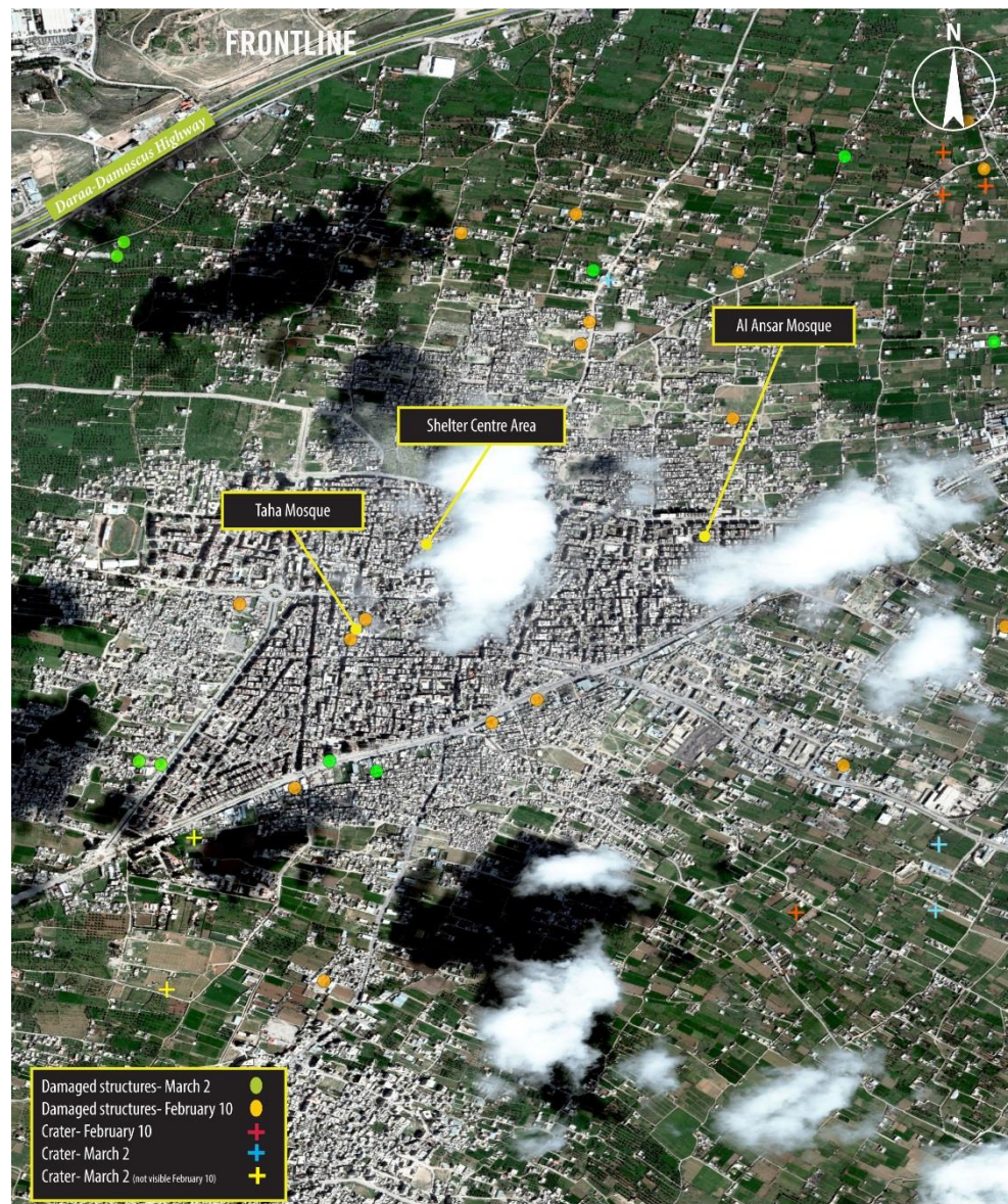
DigitalGlobe Natural Color Imagery, March 2, 2015, 33.5695°, 36.4025°

In the Douma area, almost 30 damaged locations were visible in satellite imagery between 28 December 2014 and 2 March 2015. Over 10 new craters were also visible around the town. Some areas could not be fully analysed because of cloud cover. Douma is adjacent to the front line along the Daraa-Damascus highway.