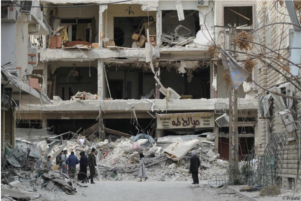
A residential building near the Taha mosque in the Khorshid neighbourhood that was destroyed by a Syrian government air strike on 5 February 2015.