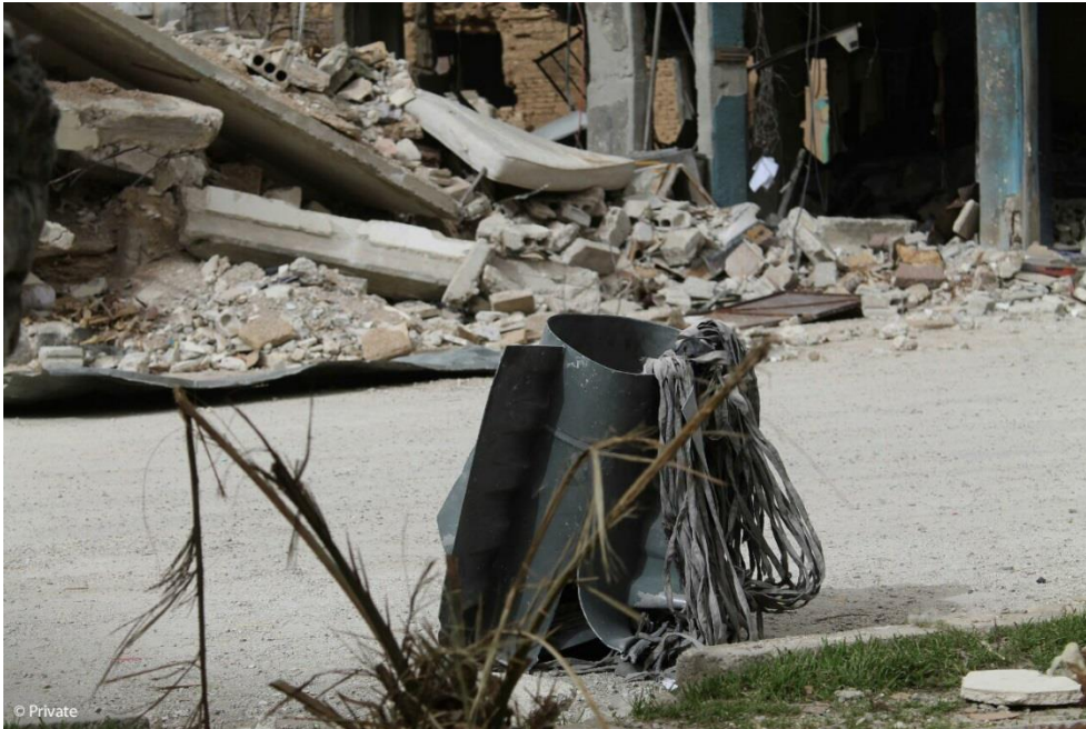
Remnants of a bomb that fell near the Taha mosque on 5 February 2015; the munition used appears from the remnants to have been either a BETAB-500SHP aerial bomb or an ODAB-500PM fuel-air bomb.

Amnesty International also reviewed two images that local activists provided that show remnants of a bomb dropped by a Syrian air force jet that attacked Douma on 5 February 2015, including the tail section of the bomb with part of its parachute still attached. Weapons experts identified the bomb as a munition developed in the former Soviet Union, most likely either a BETAB-500SHP aerial bomb containing around 350kg of high explosives that was designed primarily as a weapon to penetrate and smash concrete and hardened shelters or bunkers, or an ODAB-500PM fuel-air bomb. Attaching a parachute slows the descent of the bomb, as witnesses reported. Syrian government forces are reported to have used both of these types of aerial munitions in Aleppo and other areas. 36