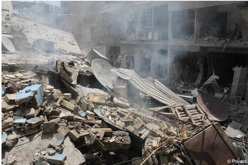
Ruins of a residential building in al-Masaken, destroyed by a Grad rocket fired by Syrian government forces on 16 June 2015.

Video footage filmed in the aftermath of the missile strike on al-Masaken that Amnesty International reviewed shows one building razed to the ground, Civil Defence workers pulling a girl from the rubble and others trying to free a man, his wife and a child who are buried, and bodies of victims in civilian clothes laid out on the ground. 109 No fighters or military targets are visible.