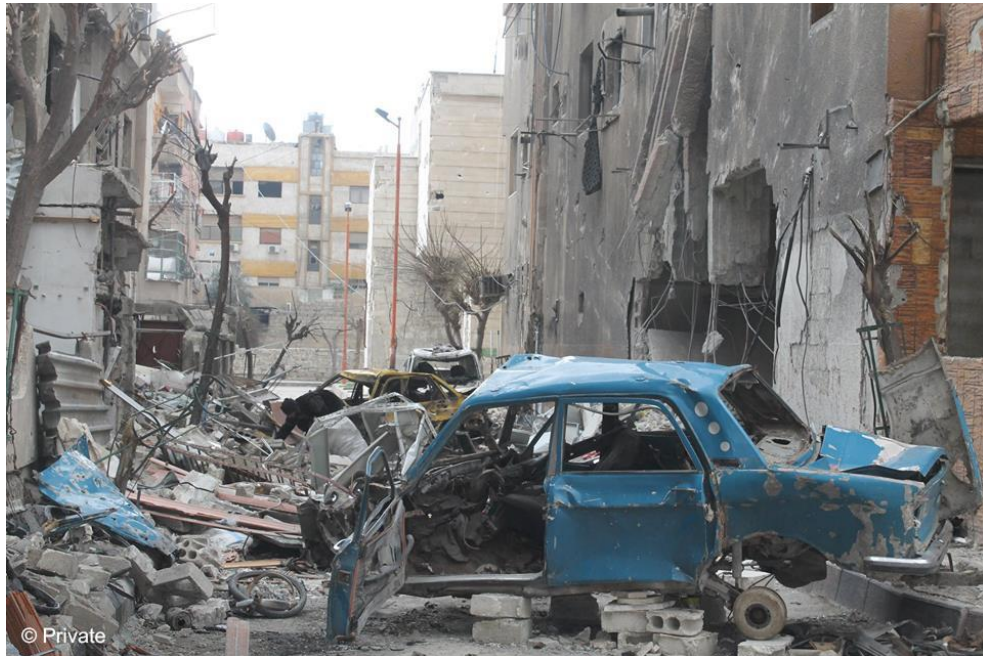
Ruins of residential buildings near the al-Ansar mosque in al-Masaken neighbourhood that were destroyed by government air strikes in February 2015.