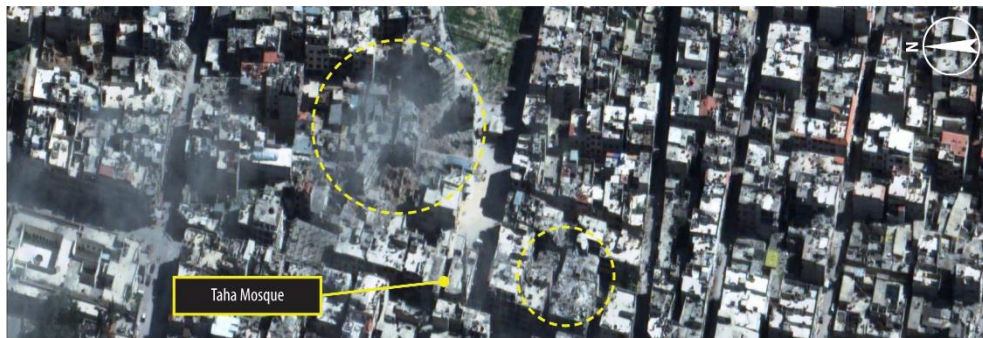
DigitalGlobe Natural Color Imagery, March 2, 2015, 33.5697°, 36.3980°

The Taha mosque area of Douma after being attacked. Satellite imagery on 10 February is hazy but variations in the texture of the area are visible, indicating damage. Yellow circles show the damaged areas.