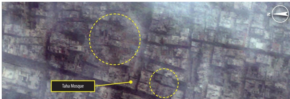
DigitalGlobe Natural Color Imagery, February 10, 2015, 33.5697°, 36.3980°

On 28 December 2014, satellite imagery shows the Taha mosque area of Douma. Yellow circles indicate where the damage will be visible in subsequent images.