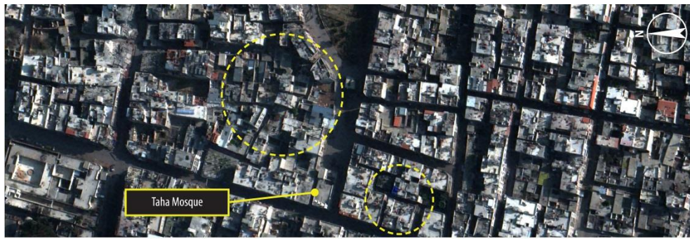
DigitalGlobe Natural Color Imagery, December 28, 2014, 33.5697°, 36.3980°

On 28 December 2014, satellite imagery shows the Taha mosque area of Douma. Yellow circles indicate where the damage will be visible in subsequent images.