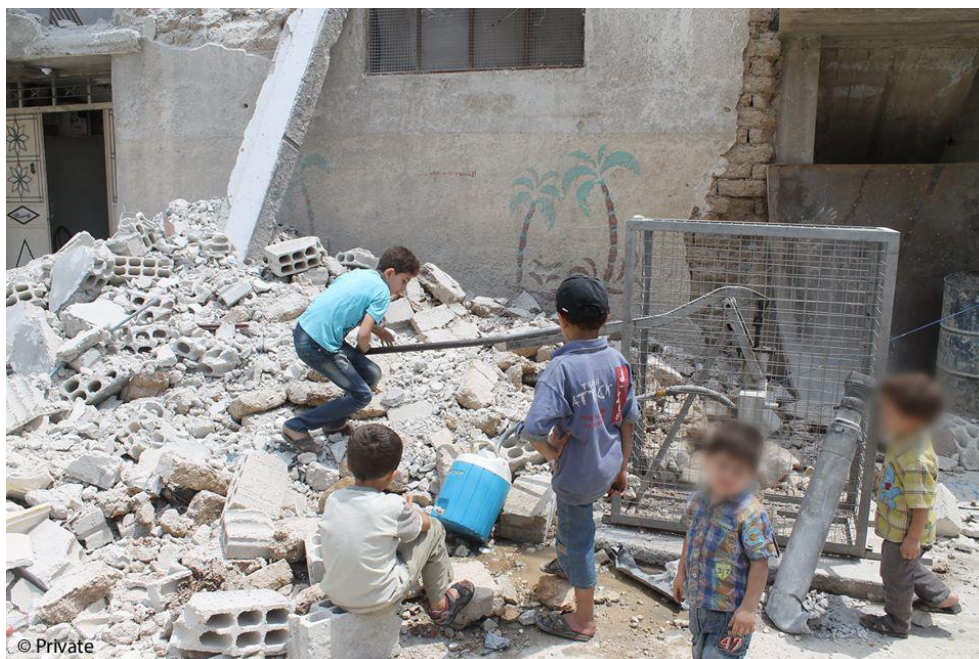
Children pumping groundwater amid the ruins of a destroyed building in the al-Masaken neighbourhood in June 2015.

Some residents said that they purchased electricity from people who had their own generators in order to pump water into household tanks for a short period each but doctors, aid workers and others told Amnesty International that many families could no longer afford to buy electricity supplies from private generators and have been reduced to using buckets to collect ground water.