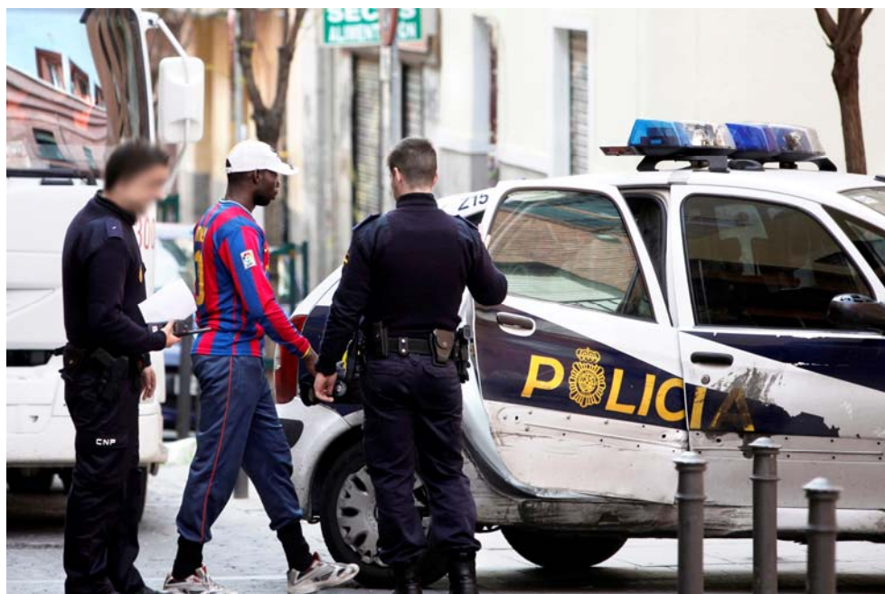
A man from subsaharan Africa is taken to a police station, Lavapiès neighbourhood, Madrid, April 2010, © Olmo Calvo / Fronteras Invisibles

This form of “preventive detention” of an individual who has provided identity documents is neither a detention for the purpose of identification, nor pre-charge detention. According to Inmigrapenal, a group of law professors and criminal law experts, the “preventive detention” of individuals who have provided proof of their identity has no legal basis, contrary to Article 17.1 of the Spanish Constitution, Article 9 of the International Covenant on Civil and Political Rights (ICCPR) and Article 5.1 of the European Convention on Human Rights (ECHR). 50