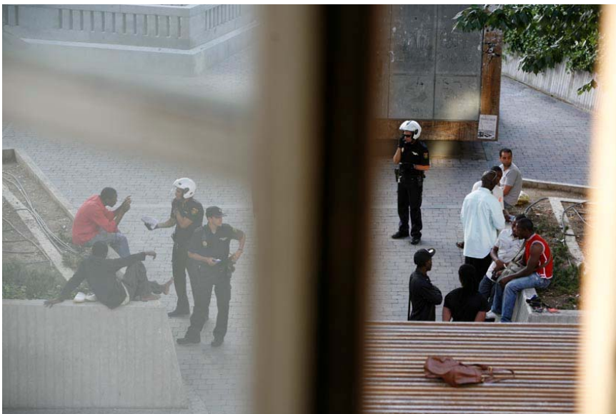
Police check the identity documents of migrants in the square of Tirso de Molina, Madrid, June 2010

“We can't even enjoy being outside for a moment. Every day the police ask to see my documents at the exit of a metro station, inside the station. It makes me feel uncomfortable when I go out... There is a lot of racism in Spain. Sometimes when I sit down in the metro, the person next to me gets up. It's like they don't want me here”. He said that even when he shows his refugee card, the police sometimes take him to the police station; they say they need to check. “The police should know the card of a refugee”, he said. “It is difficult to integrate in Spain. We feel we are not welcome in this country”.