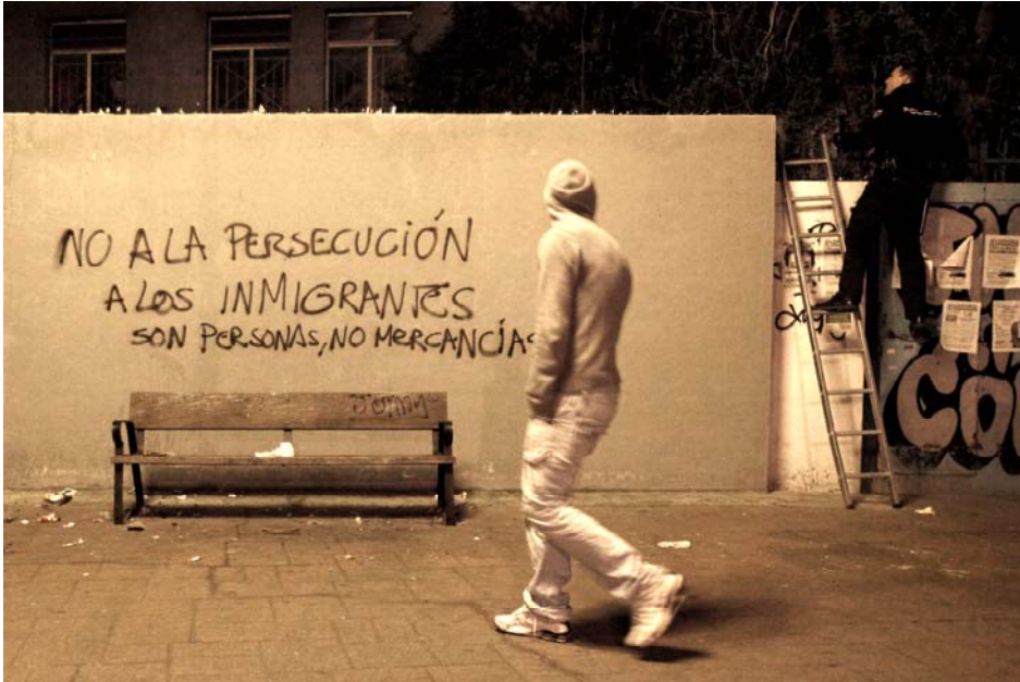
“No to the persecution of migrants, they are people, not merchandise”, writing on a wall in the neighbourhood of Usera, Madrid, March 2010

Public statement by the Association of Undocumented Migrants in Madrid (Asociación de Sin Papeles de Madrid), May 2010