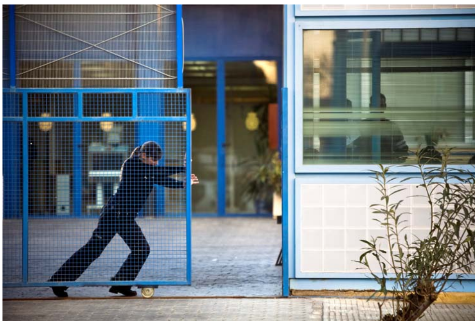
Immigration detention centre "Zona Franca", Barcelona, January 2011.

The Aliens Law provides a number of precautionary measures that can be imposed by the official who initiated the expulsion proceedings, to ensure that the expulsion is carried out. Those measures include regular reporting by the individual to the competent authorities; compulsory residence in a certain place; withdrawal of the individual's passport or other document that proves his or her nationality; precautionary detention by a government authority or its agents for a maximum of 72 hours prior to requesting a placement in an immigration detention centre (CIE); or detention, following an authorization by a judge, in a CIE for a maximum of 60 days. Once a person has been detained in a CIE for 60 days they cannot be placed in a CIE again. 72