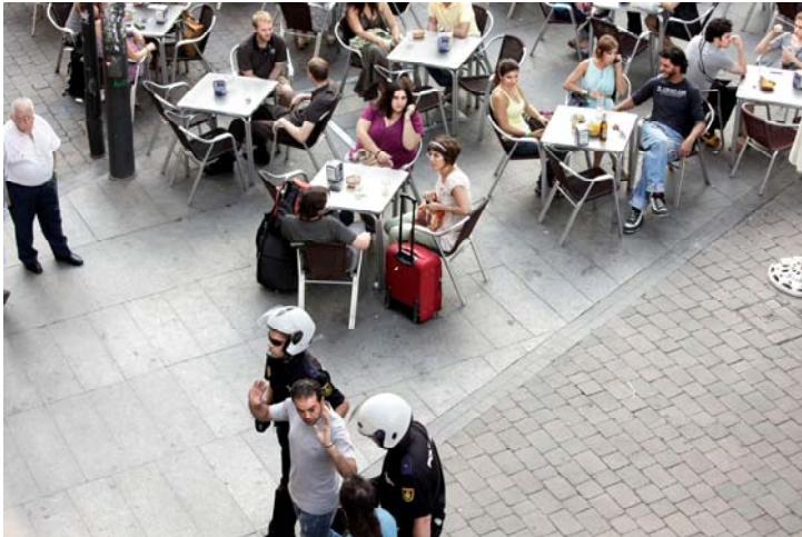
Police arrest a migrant in the square of Tirso de Molina in Madrid, June 2010

“I want people to know that we, migrants, we are not numbers. We have the same heart, two hands, the same as people who are working all over the world”.