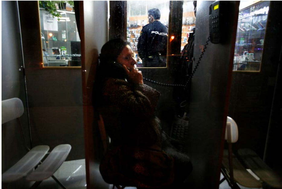
National Police officer inside a locutorio in the neighbourhood of Usera in Madrid, January 2011.

One police union representative told Amnesty International: “if you have to identify foreigners, whoever looks like a foreigner, you go where you will find them”. 28