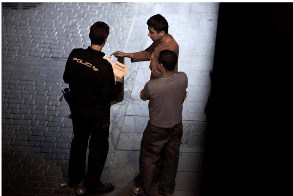
Identity check in Lavapiés, May 2010, © Olmo Calvo / Fronteras Invisibles

Despite these assurances, research by Amnesty International has led to the conclusion that people belonging to ethnic minorities continue to be targeted for identity checks based on their ethnicity.