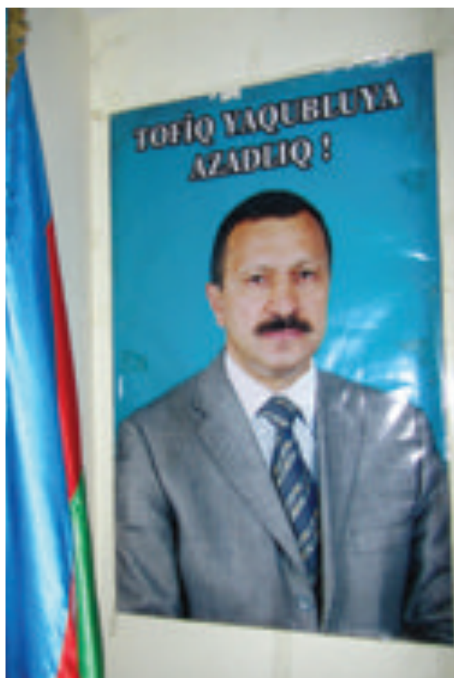
(Right) A poster in the Musavat's head office in Baku depicting the deputy Head of the Musavat Tofiq Yagublu. The poster reads in Azerbaijani: 'Free Tofiq Yagublu!'