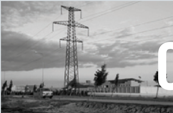
Kurdakhany detention facility

Some of the prisoners of conscience, including prominent civil society leaders – Leyla Yunus, Khadija Ismayilova, Rasul Jafarov and Intigam Aliyev – are being held in the Kurdakhany detention facility, just outside Baku.