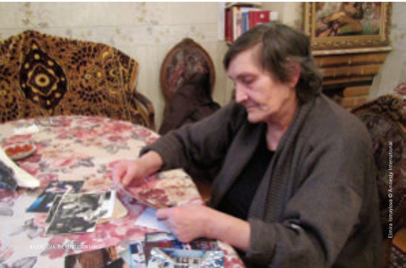
Elmira Ismayilova