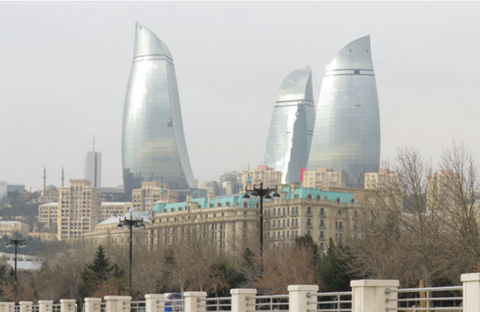
(Above) Flame Towers in downtown Baku

The first ever European Games 1 are due to take place in Baku, the capital of Azerbaijan, on 12-28 June 2015. This multi-sport event will involve around 6,000 athletes and features a new state-of-the-art stadium costing some US$640 million.