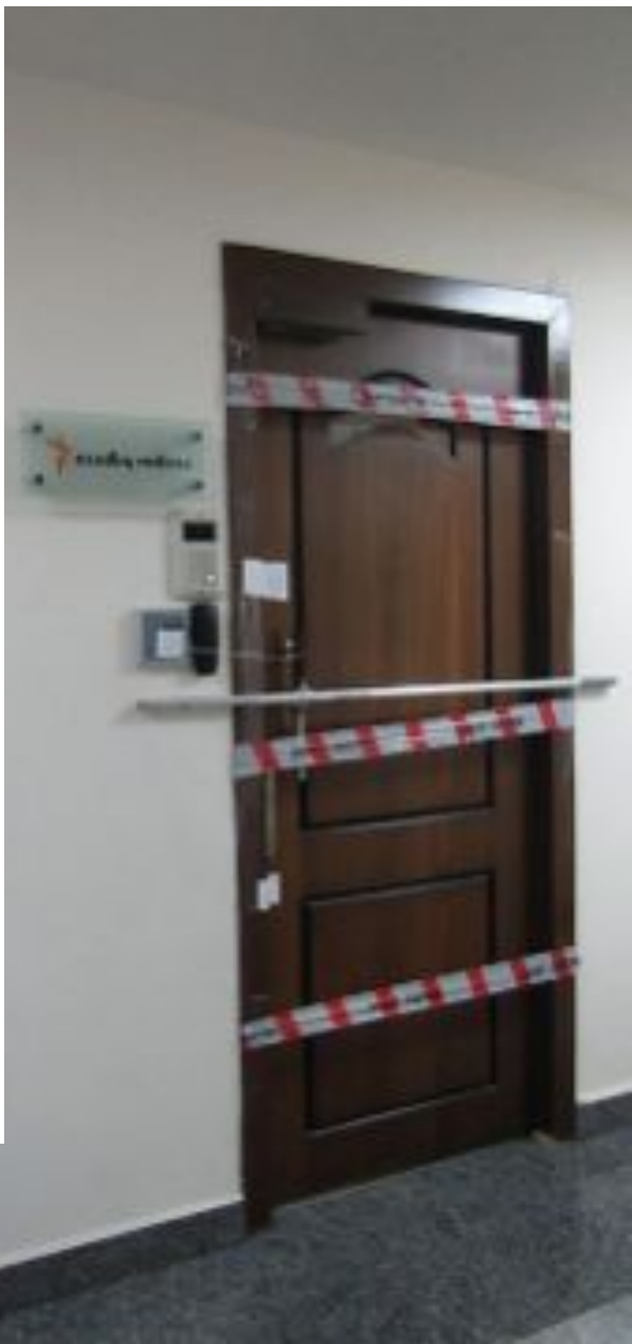
(Above) Radio Free Europe, Radio Liberty's office door remains sealed in Baku since December 2014

The Media Rights Institute, another NGO under attack by the authorities, has provided legal aid to more than a hundred journalists targeted because of their work since 2002. In August 2014, it was forced to cease all activities following a campaign of harassment by the government. The authorities froze the assets and bank accounts of the NGO and its staff, raided its premises and fined the organization 53,000 manats (approximately US$50,000) for failing to register grants. According to the organization's lawyer, the screenshots from the Ministry of Justice website showed that the grants had in fact been duly registered. However, this information disappeared from the website during the investigation.