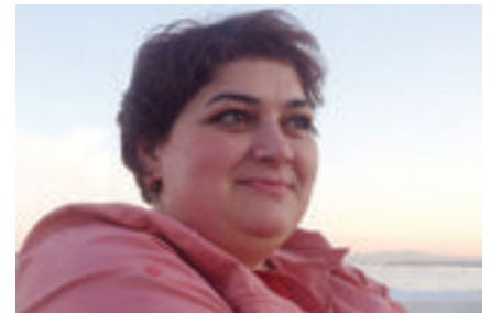
(Above) Khadija Ismayilova