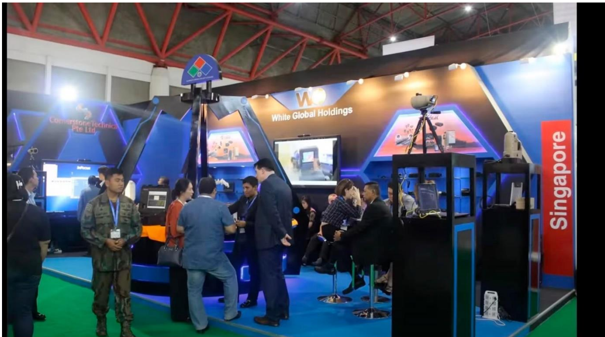
Figure 6: White Global Holdings has been active for over a decade and has participated in multiple regional industry trade fairs, including INDODEFENSE 2014 and INDODEFENSE 2016 where it had a stand. Stand of White Global Holdings at Indodefense 2016 as recorded by “ KUKU PRODUCTION Rental Multimedia Audio Visual ”

White Global Holdings PTE Ltd (“White Global Holdings”) is a company located in Singapore, which alongside 3L PTE Ltd (“3L”) and ESW Systems, also located in Singapore, make up a group of “associated and/or affiliated” companies, as described in the former’s website , active in the sale of surveillance and other military and policing technologies.